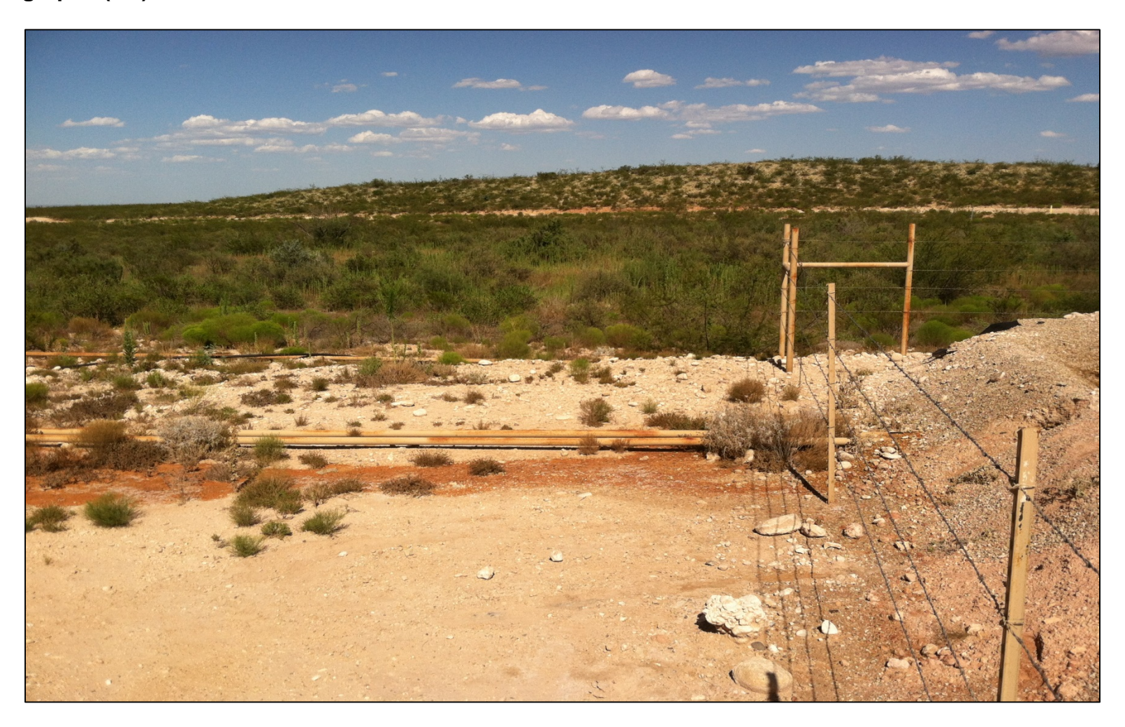
Photo Point 4: View of released water escaping via north side of berm