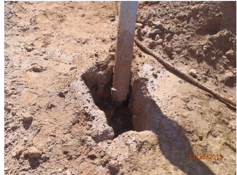
Rock evident at base of vertical