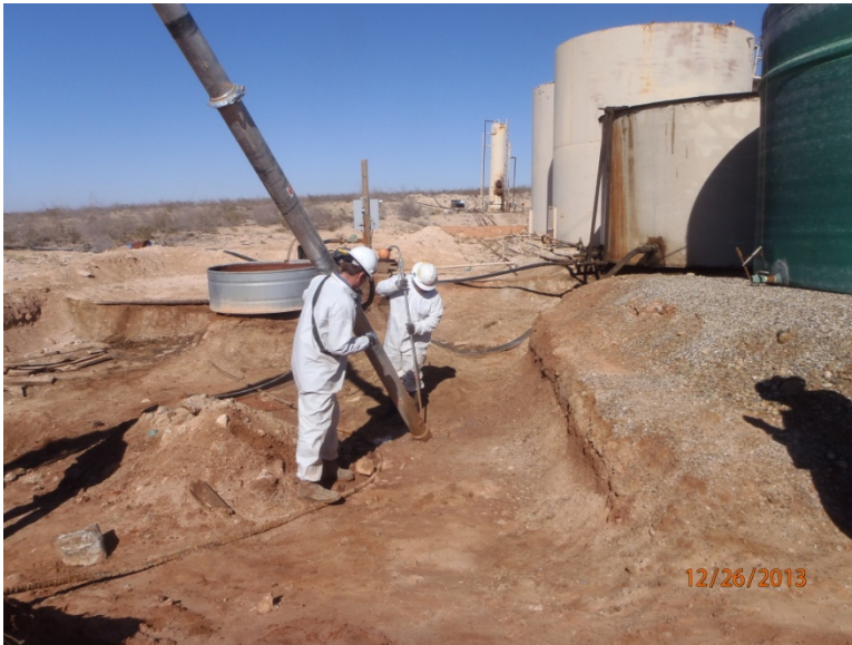
Checking for rock, facing north