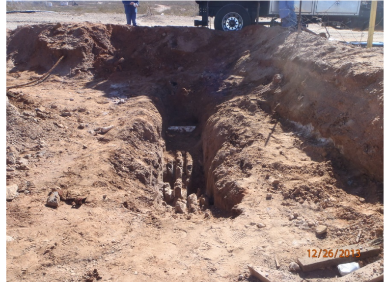
Vertical completed, facing south 12/26/13