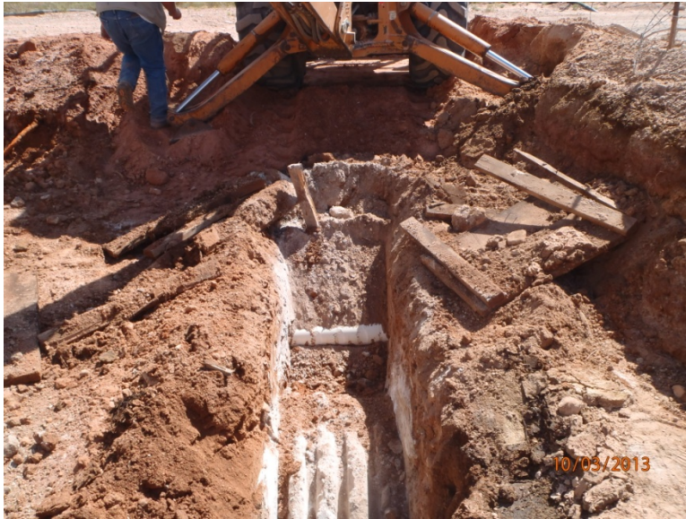
Vertical abandoned due to unmarked pipeline discovered 10/3/13