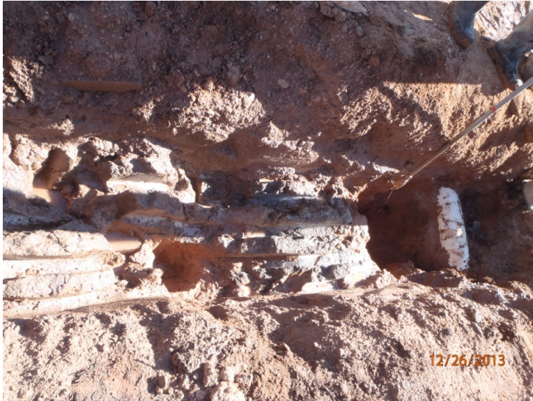
Rock at base of vertical 12/26/13