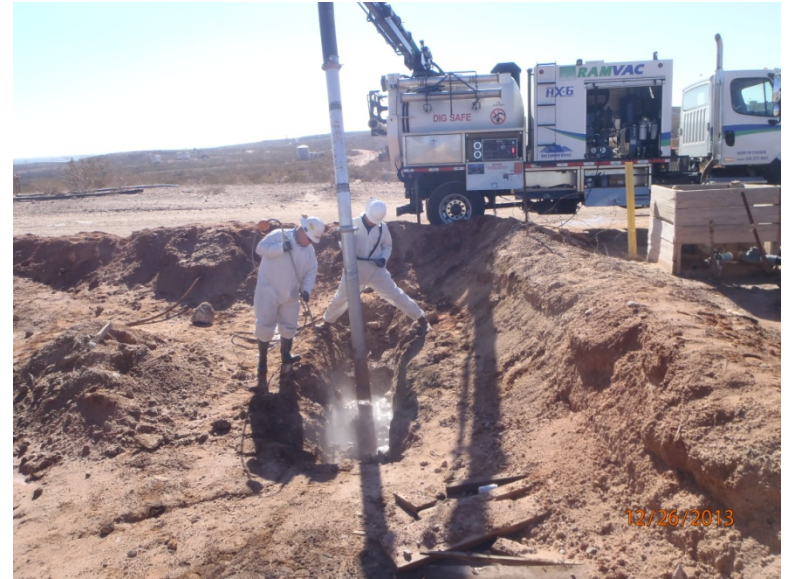
Excavating with hydrovac, facing south 12/26/13