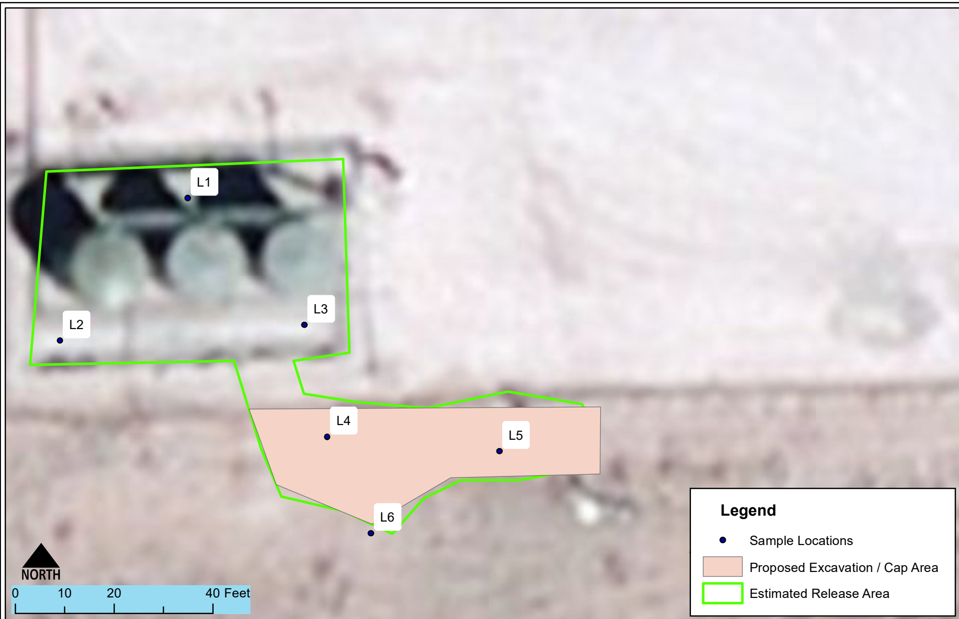
SITE AND SAMPLE LOCATION MAP Quick Draw 22 D #1 Battery- Mewbourne S:22 T20S R25E, New Mexico