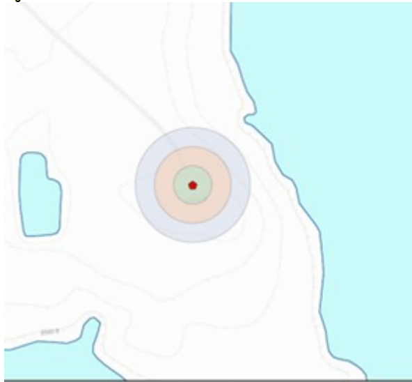
Surface Water Protection Map Black Horse 7 Fed Com 1H - Monahan Oil Sec. 7 T20S R31E, Lea County, New Mexico