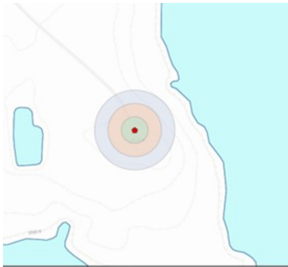
Surface Water Protection Map Black Horse 7 Prod Cons 12H - Marathon Oil Sec. 7 T20S R31E, Lea County, New Mexico