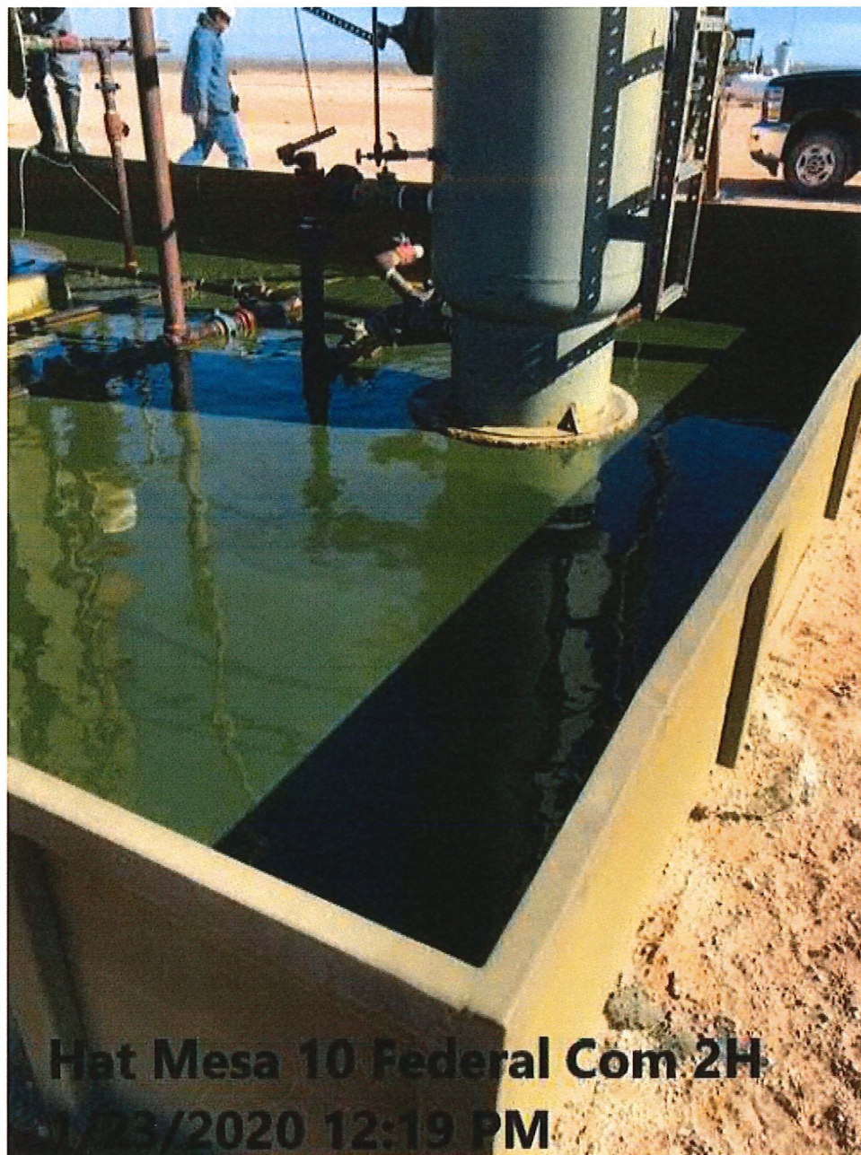
Hat Mesa 10 Federal Com 2H 1/23/2020 12:19 PM