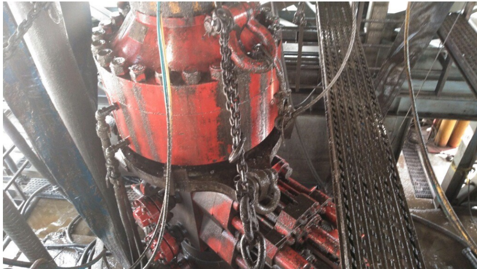
Figure 1: Winch System attached to BOP Stack

OOGO No. 2 became effective on December 19, 1988 and has remained the standard for regulating BLM onshore drilling operations for over 30 years. During this time there have been significant changes in drilling technology. BLM continues to use the variance request process to allow for the use of modern technology and acceptable engineering practices that have arisen since OOGO No. 2 was originally released. The XTO Energy drilling rig fleet has many modern upgrades that allow the intact BOP stack to be moved between well slots on a multi-well pad, as well as, wellhead designs that incorporate quick connects facilitating release of the BOP from the wellhead without breaking any BOP stack components apart. These technologies have been used extensively offshore, and other regulators, API, and many operators around the world have endorsed break testing as safe and reliable.