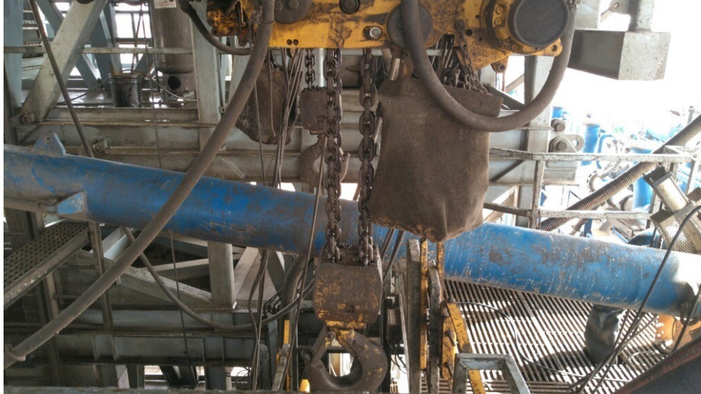
Figure 2: BOP Winch System

American Petroleum Institute (API) standards, specification and recommended practices are considered the industry standard and are consistently utilized and referenced by the industry. OOGO No. 2 recognizes API recommended Practices (RP) 53 in its original development. API Standard 53, Well Control Equipment Systems for Drilling Wells (Fifth Edition, December 2018, Annex C, Table C.4) recognizes break testing as an acceptable practice. Specifically, API Standard 53, Section 5.3.7.1 states “A pressure test of the pressure containing component shall be performed following the disconnection or repair, limited to the affected component.” See Table C.4 below for reference.