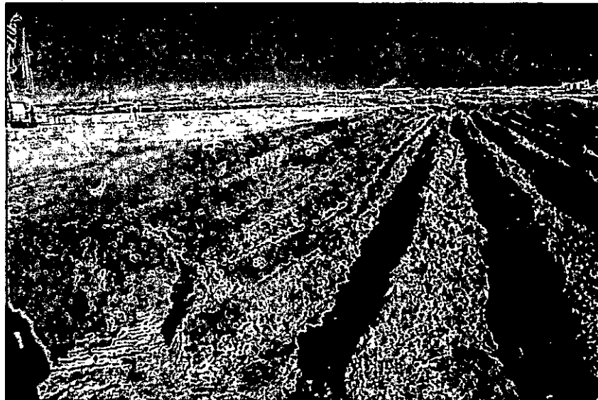
EAST EDGE OF WELL PAD FACING NORTH – BERMED WITH RIPS RUNNING ACROSS THE SLOPE FROM THE EAST. THE SOUTH SLOPE HAS BEEN BERMED OFF