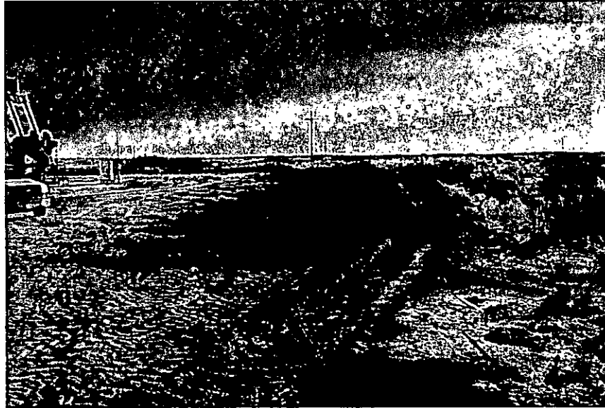
SOUTH EDGE OF WELL PAD FACING EAST – BERMED TO PREVENT RUN ON FROM SOUTH SLOPE. RIPPED SO RAINWATER IS TRAPPED FOR VEGETATION GROWTH WHICH WILL HOLD BERM IN PLACE – ALL BERMS HAVE BEEN SEEDED