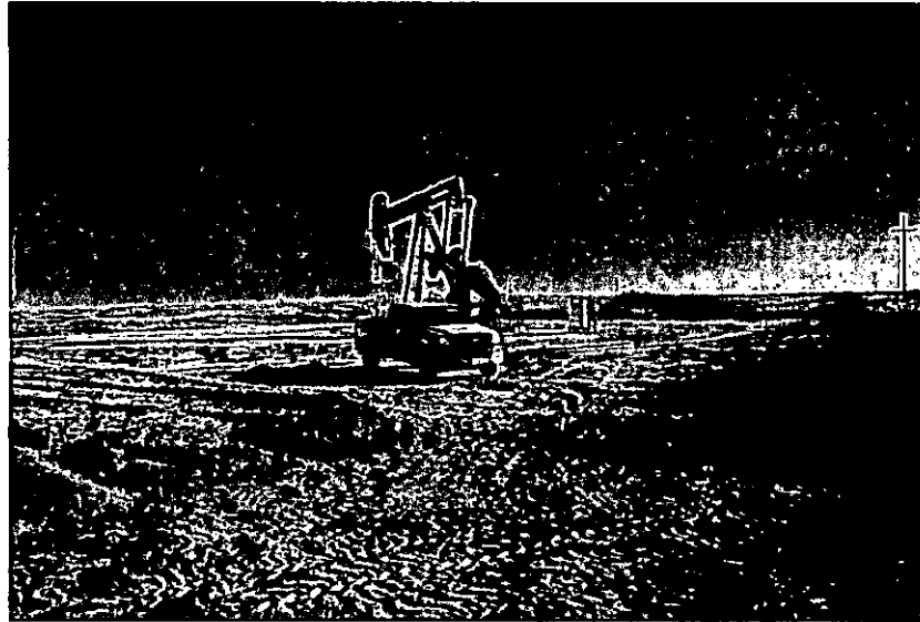
OVERVIEW OF WELL PAD-PUMPJACK FACING ROAD ENTRANCE FOR EASY SET UP FOR WORKOVER.

B 440 FEDERAL #8; S.27,T17S,R29E; 505/S & 1025/E; 30-015-41524; NMLC-028775A