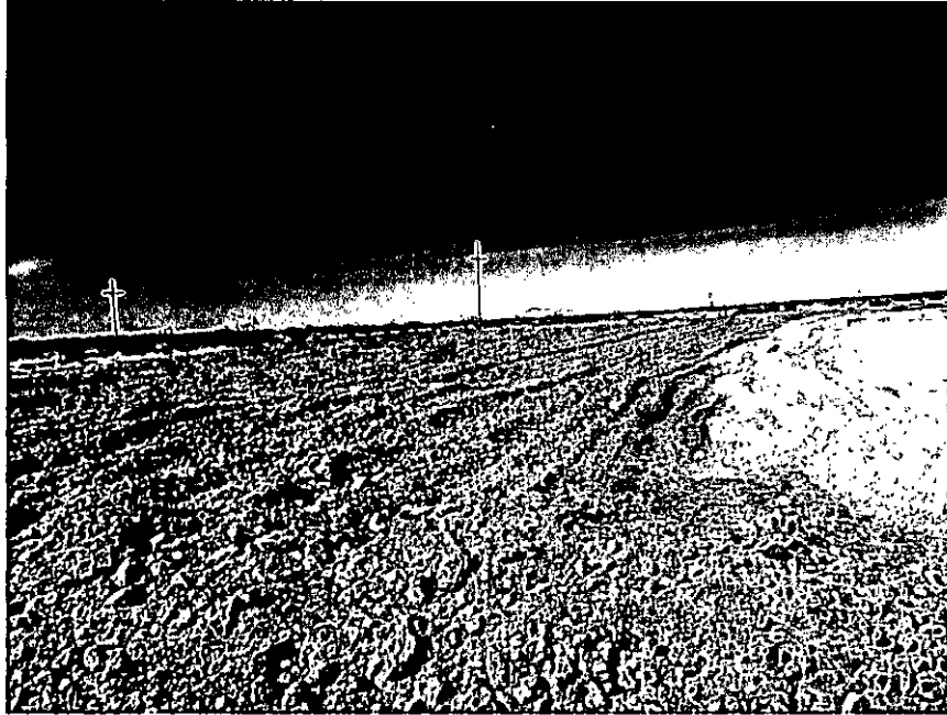
West side of well pad showing IR and berming between IR and well pad.