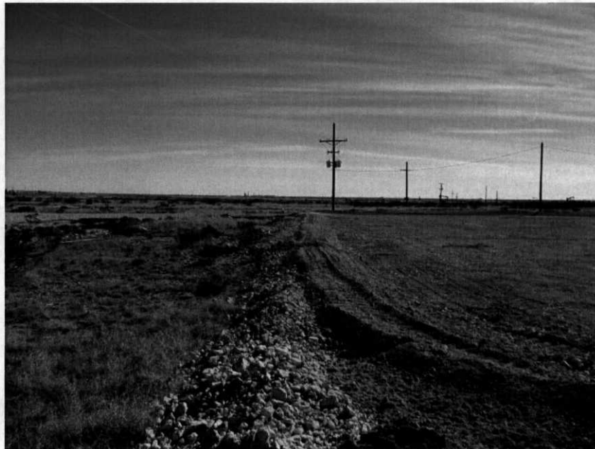
East side of well pad showing new caliche delivered for construction of berm.