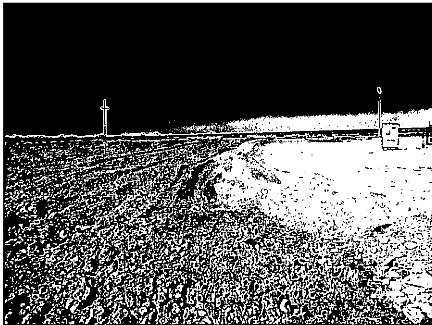
North side of well pad showing IR area and berm between well pad and IR.