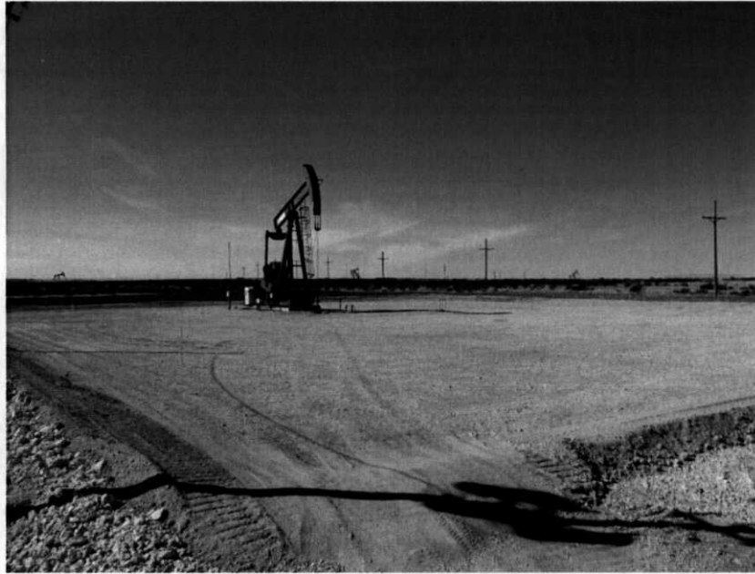
Overview of well pad at entrance on SE corner

AAO FEDERAL #14; Sec.1, T18S, R27E; 126' FNL & 141' FEL; 30-015-42024 ; NMNM-0557371