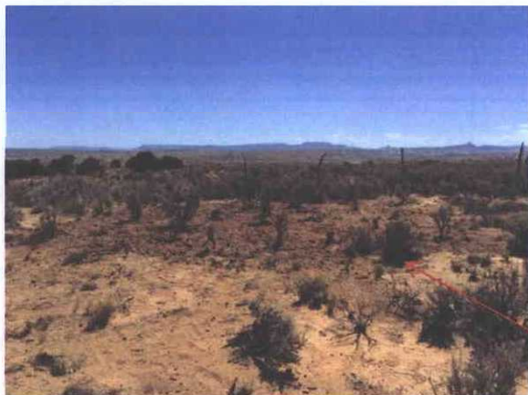
Fullerton Federal 7 – completed slab removal photos