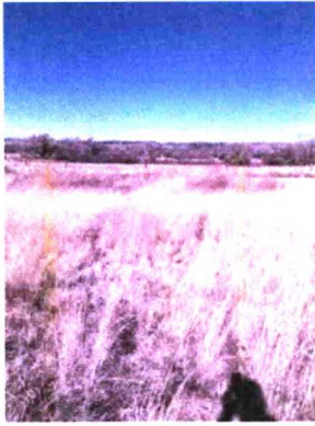
Completed work description of corrective action 2 Photo of third corrective action completed