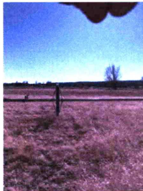
Completed work description Completed work description of corrective action 4 Summary of all work completed