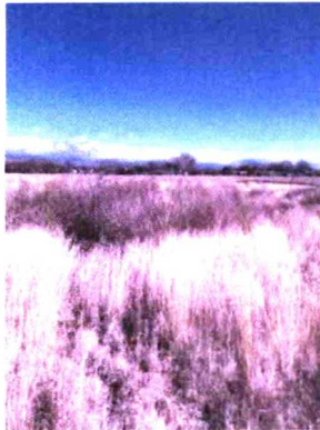
Completed work description of corrective action 3 Photo of fourth corrective action completed