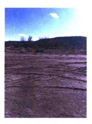
Completed work description of corrective action 2 Photo of third corrective action completed