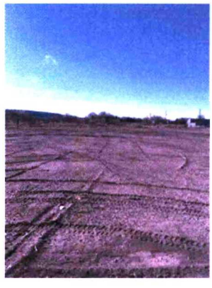
Completed work description of corrective action 3 Photo of fourth corrective action completed