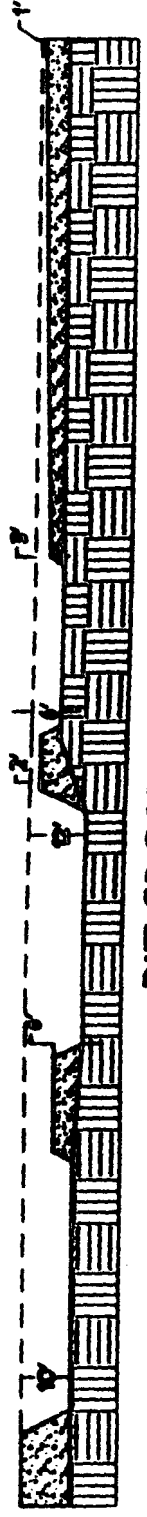
PIT CROSS SECTION