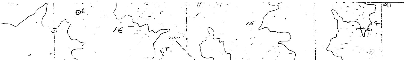
A Vicinity Map for ODESSA NATURAL CORP. #2 Jicarilla Joint Venture "KD" Lease