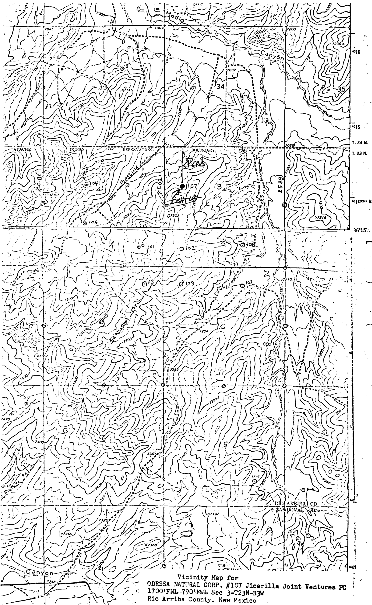
Vicinity Map for ODESSA NATURAL CORP. #107 Jicarilla Joint Ventures PC 1700'FWL-790'FWL Sec 3-T23N-R3W Rio Arriba County, New Mexico