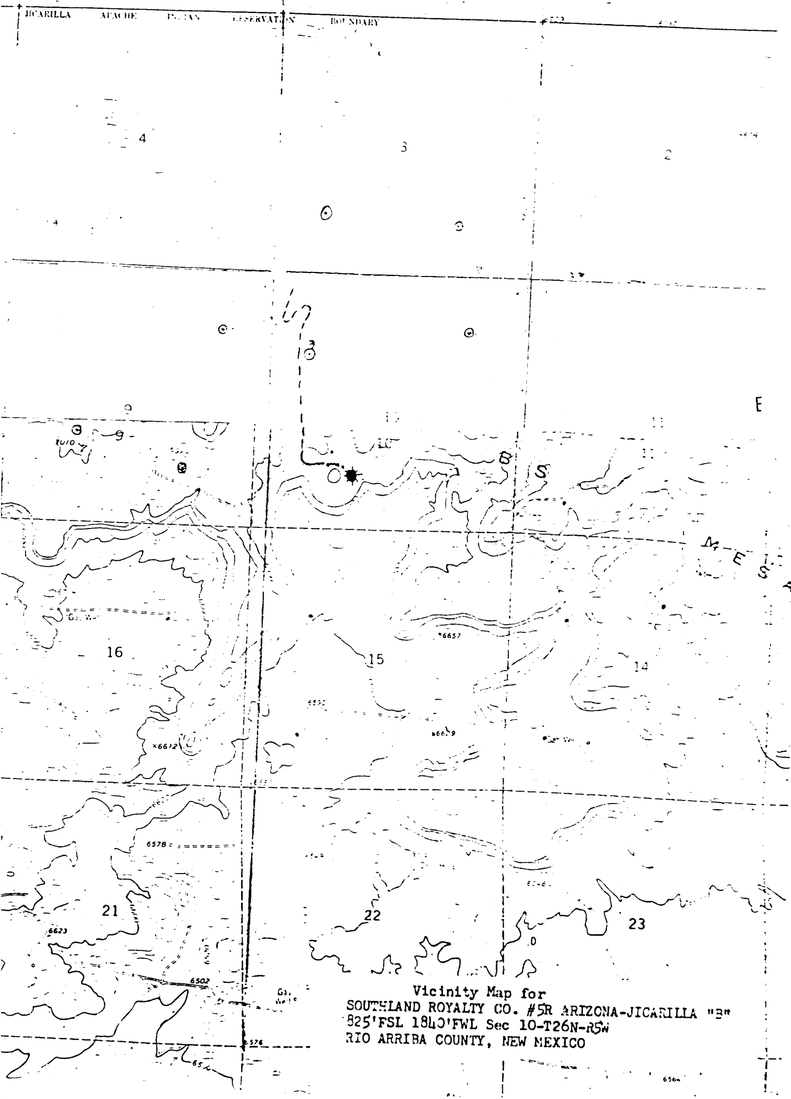
Vicinity Map for SOUTHLAND ROYALTY CO. #5R ARIZONA-JICARILLA "B" 825' FSL 1840' FWL Sec 10-T26N-R5W RIO ARRIBA COUNTY, NEW MEXICO

JICARILLA APACHE INDIAN RESERVATION BOUNDARY