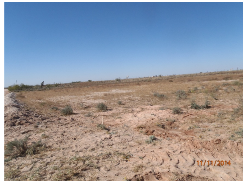
Plug and abandonment of MW-1 completed, facing northwest 11/11/14