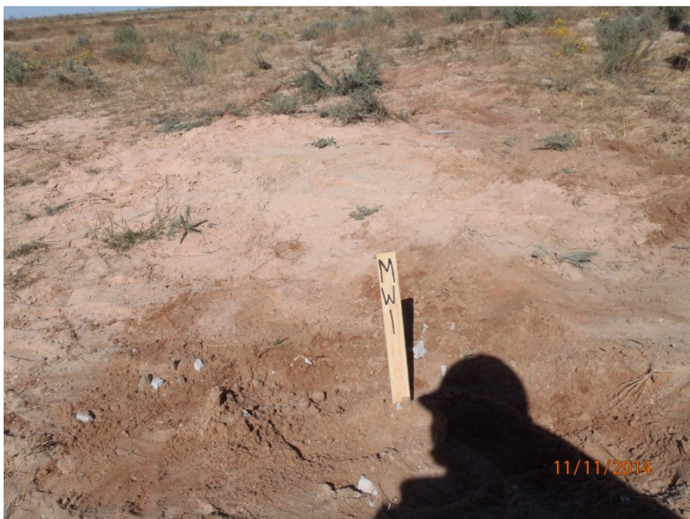
Plug and abandonment of MW-1 completed, facing north 11/11/14