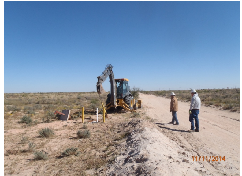
Pulling the bollards, facing east 11/11/14