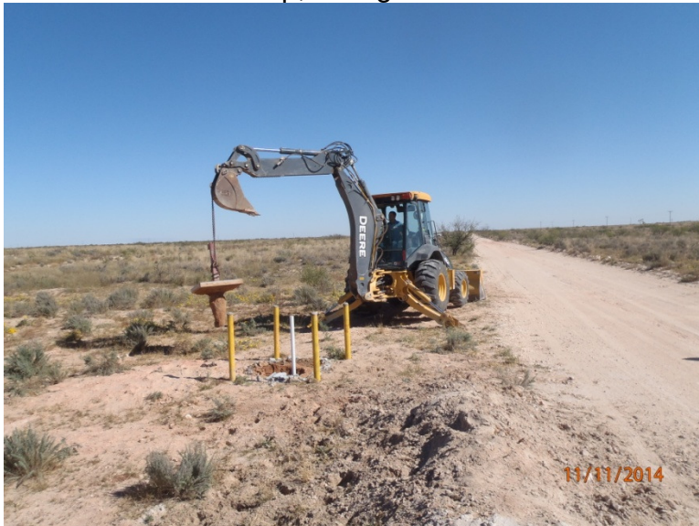
Pulling MW-1 assembly, facing east 11/11/14