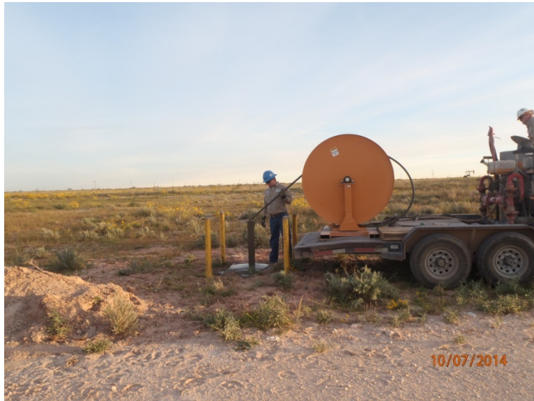
Plugging MW-1 with a 1-3% bentonite/concrete slurry with a 3 ft concrete cap, facing north 10/7/14