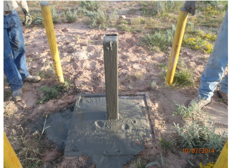
Plug and abandonment of MW-1 completed, facing north 10/7/14