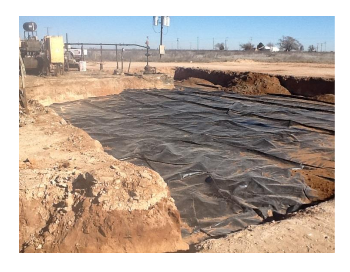
Lined north side layered topsoil