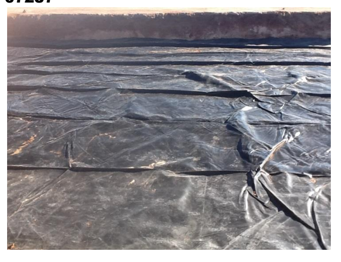
Lined area facing south