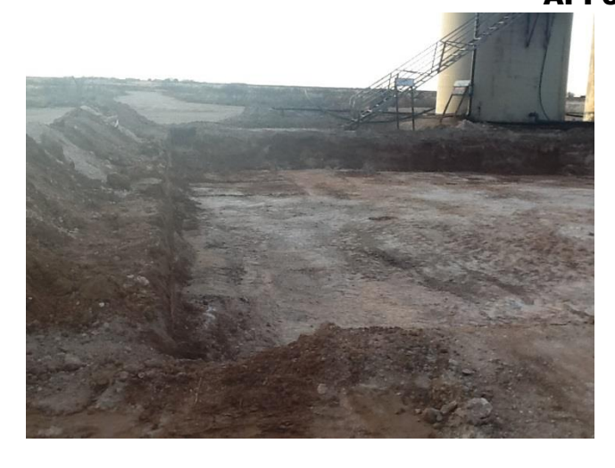
Excavated area facing west