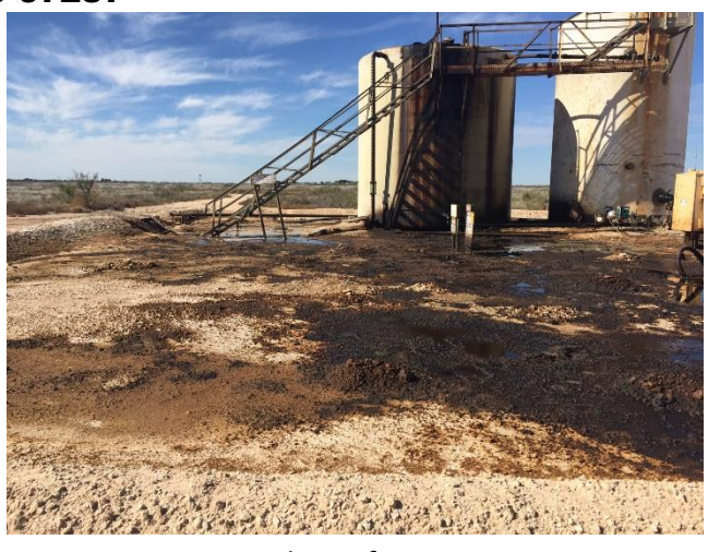
Impacted area facing west