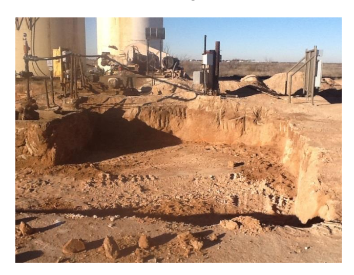
Excavated area northwest