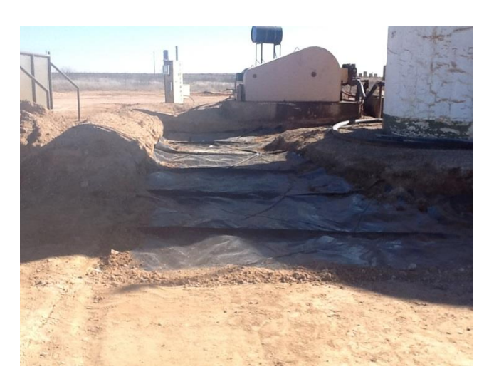
Excavated and lined west side of tanks