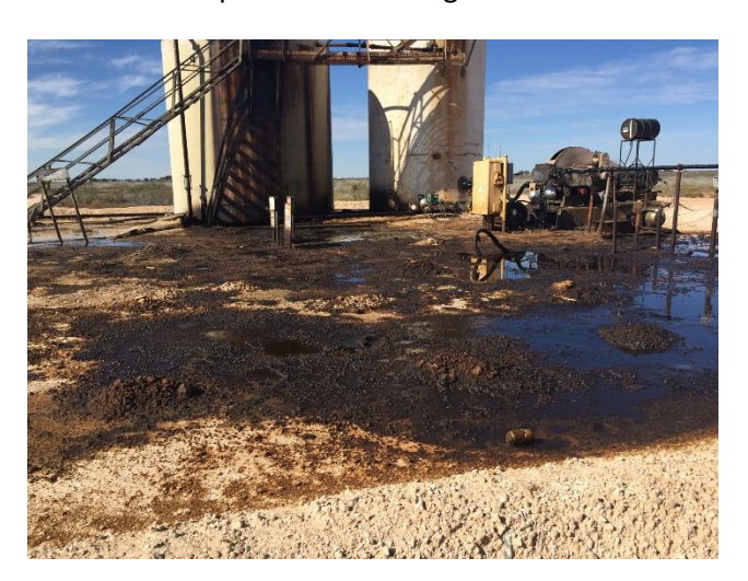
Impacted area facing northwest