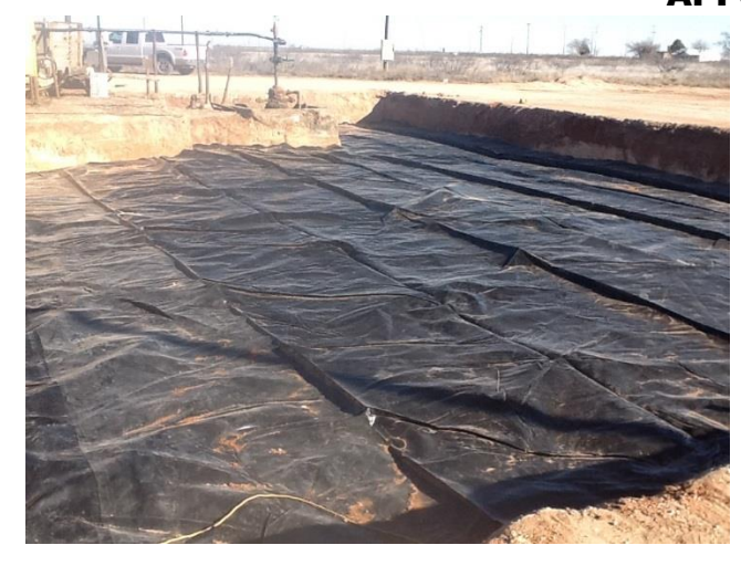
Lined Excavation facing north