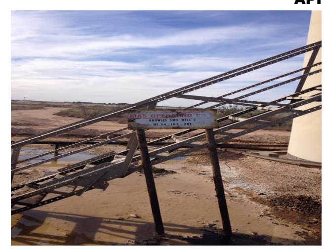
Sign marking location 11-13-15