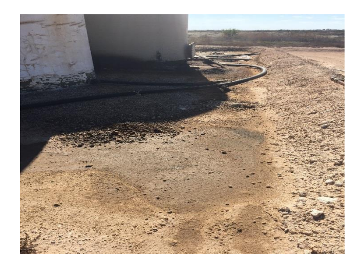
Impacted area west side of tanks