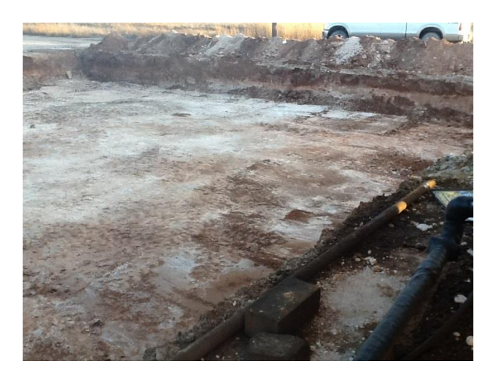
Excavated area South of battery