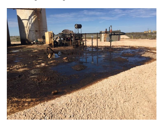
Impacted area facing northwest