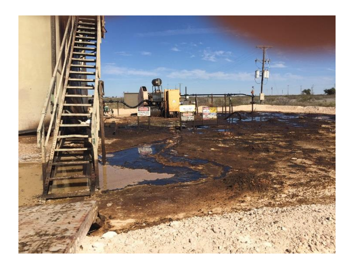
Impacted area facing north