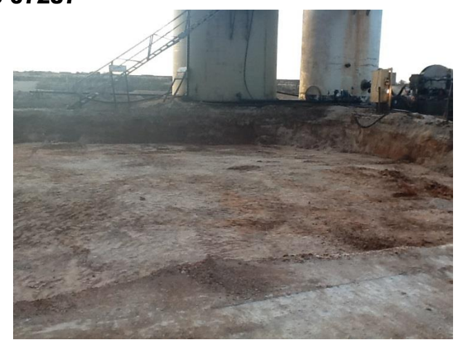
Excavated area facing northwest