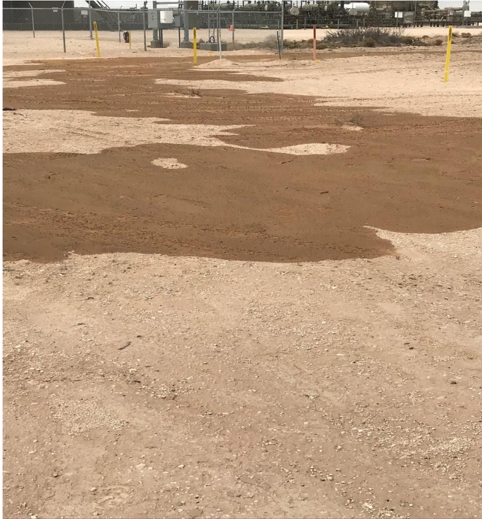
Facing North West