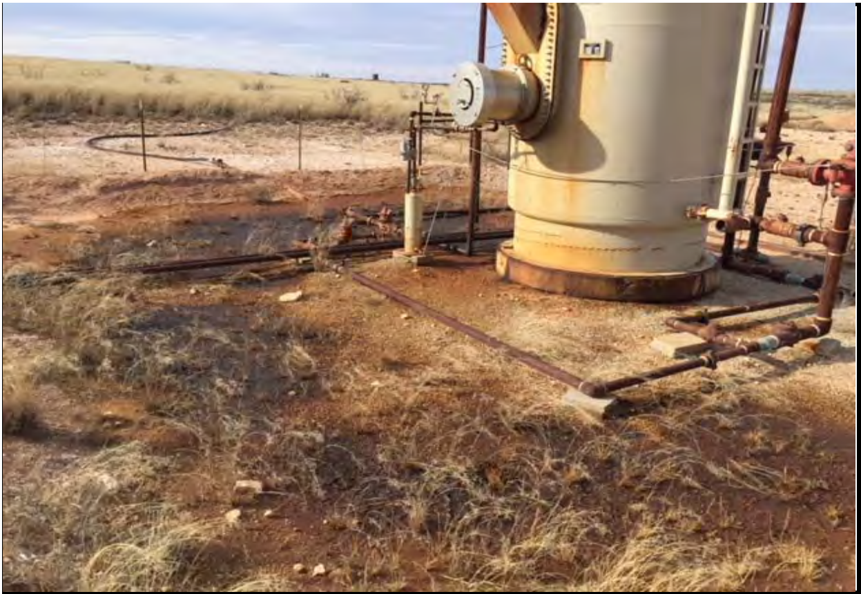
Figure 1 - View of the affected area, facing northwest.