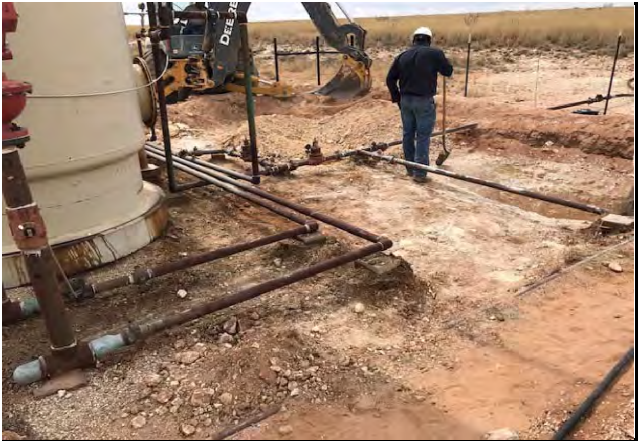
Figure 3 - View of portion of the excavated area, facing southwest.