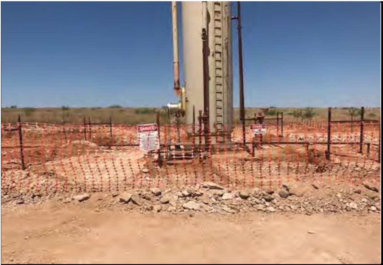
Figure 5 - View of portion of the excavated area, facing west.