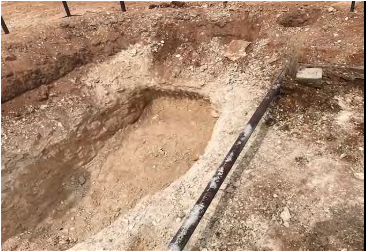
Figure 4 - View of portion of the excavated area, facing north.