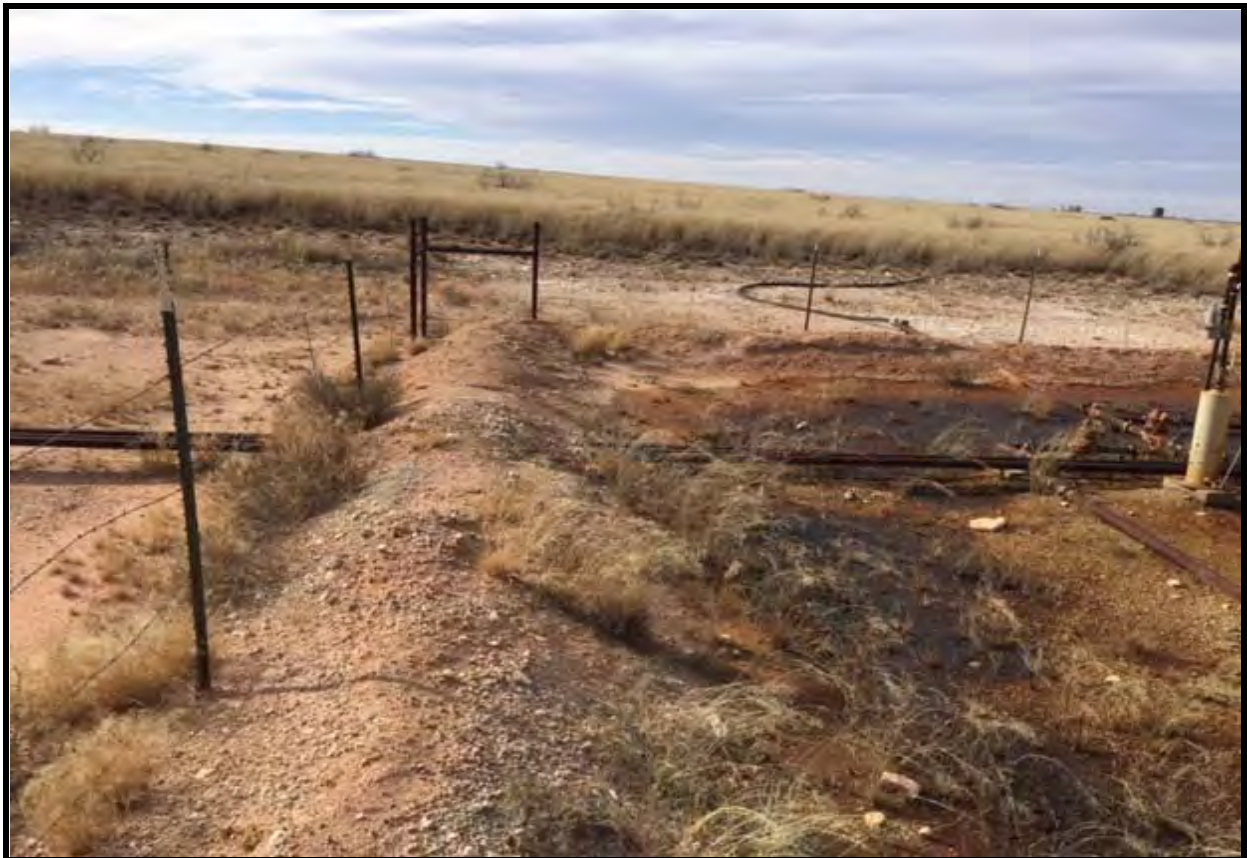
Figure 2 - View of the affected area, facing west.