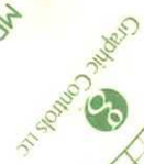
CHART NO. MC MP-1000 METER CHART PUT ON LOCATION REMARKS TAKEN OFF M

Legacy - Langley JAL #41 30-025-11437 8-40255-372 Calia JAL - 6/1/15 1000# Start - 5:30 AM End - 5:30 PM 30 min 5 Yr MIT