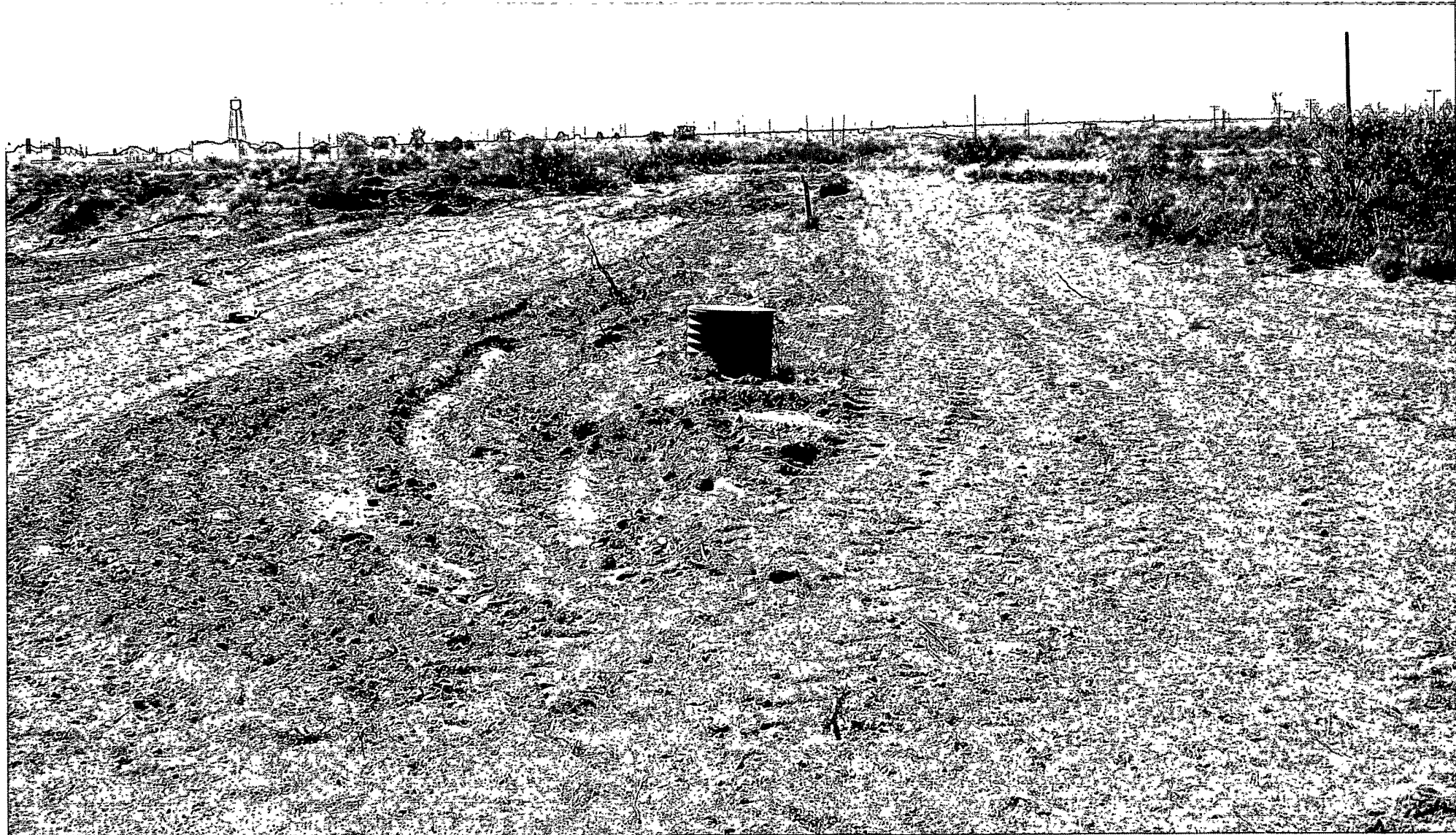
PIC #1 Looking from North to South