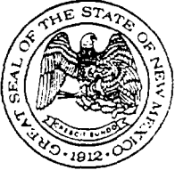
Exhibit "A" Case No. 10539 Order No. R-9772