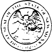
Exhibit "A" Case No. 10539 Order No. R-9772 Page 2

BRUCE KING GOVERNOR ANITA LOCKWOOD CABINET SECRETARY