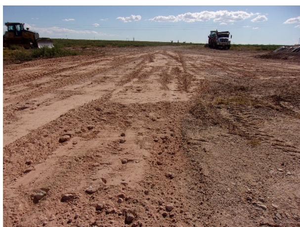
Lease Road Area