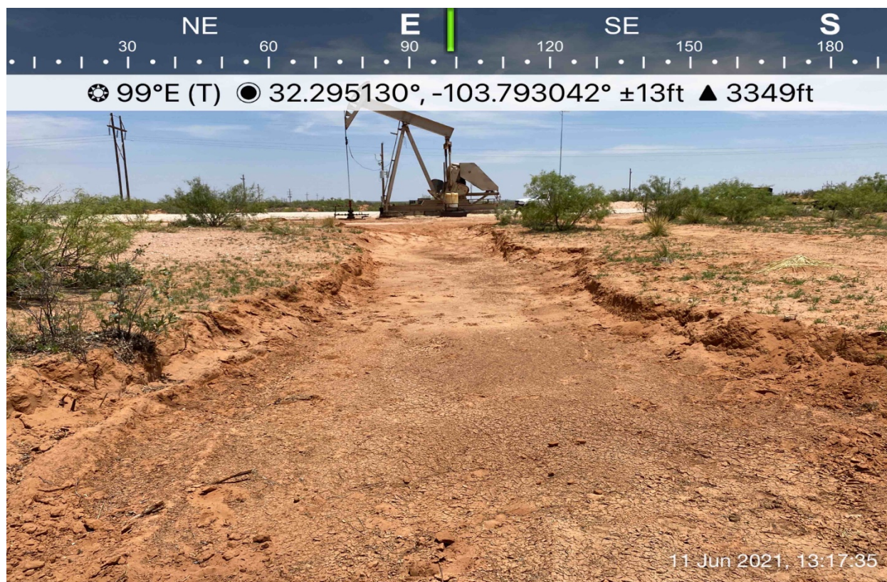
Excavation of the Pasture Release Area Looking Easterly