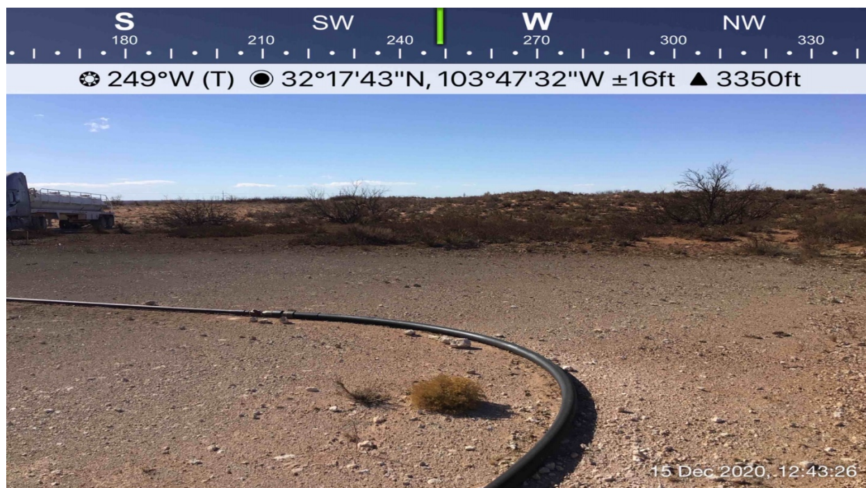
Overspray Area on the Pad Looking West-Southwest

OXY Pure Gold B Federal 10 - Coordinates 32.295006 N, -103.792038 W - Incident ID # nAPP2102858169