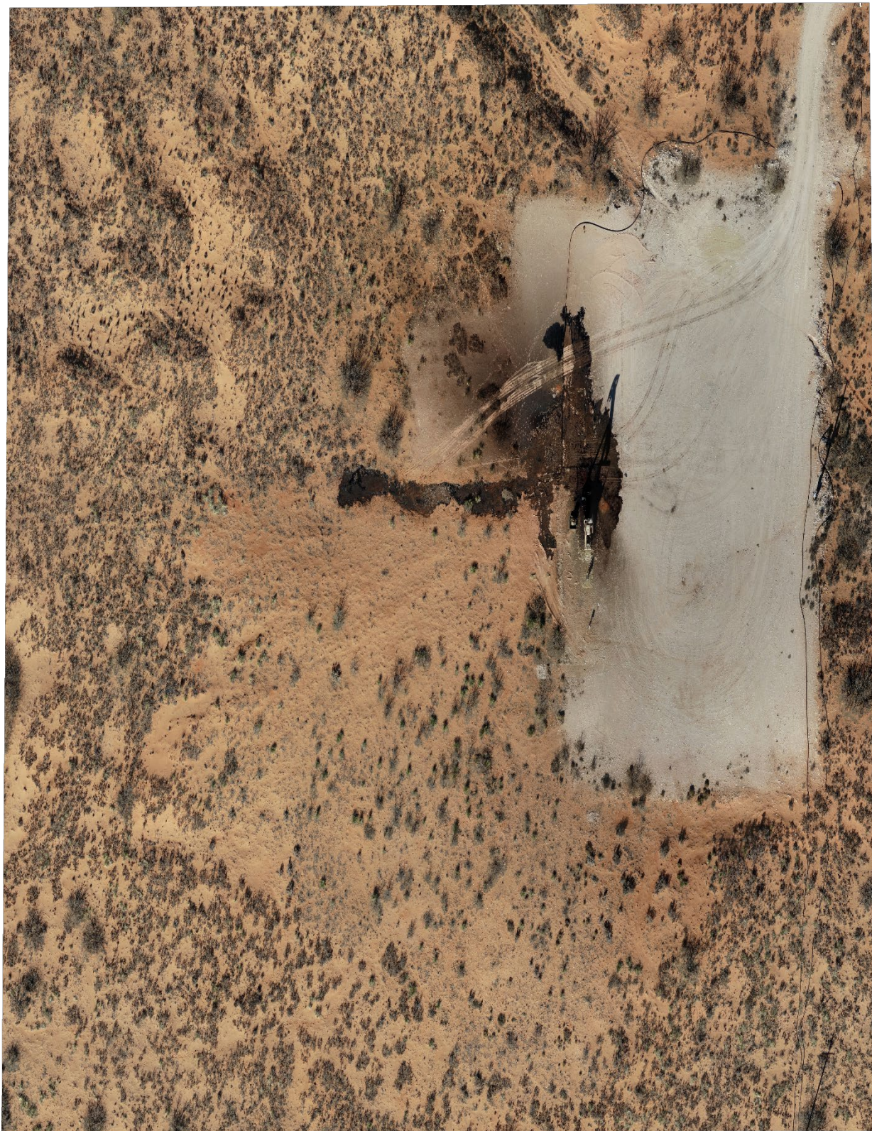
Drone Photography of the OXY Pure Gold B Federal 10 Release

OXY Pure Gold B Federal 10 - Coordinates 32.295006 N, -103.792038 W - Incident ID # nAPP2102858169