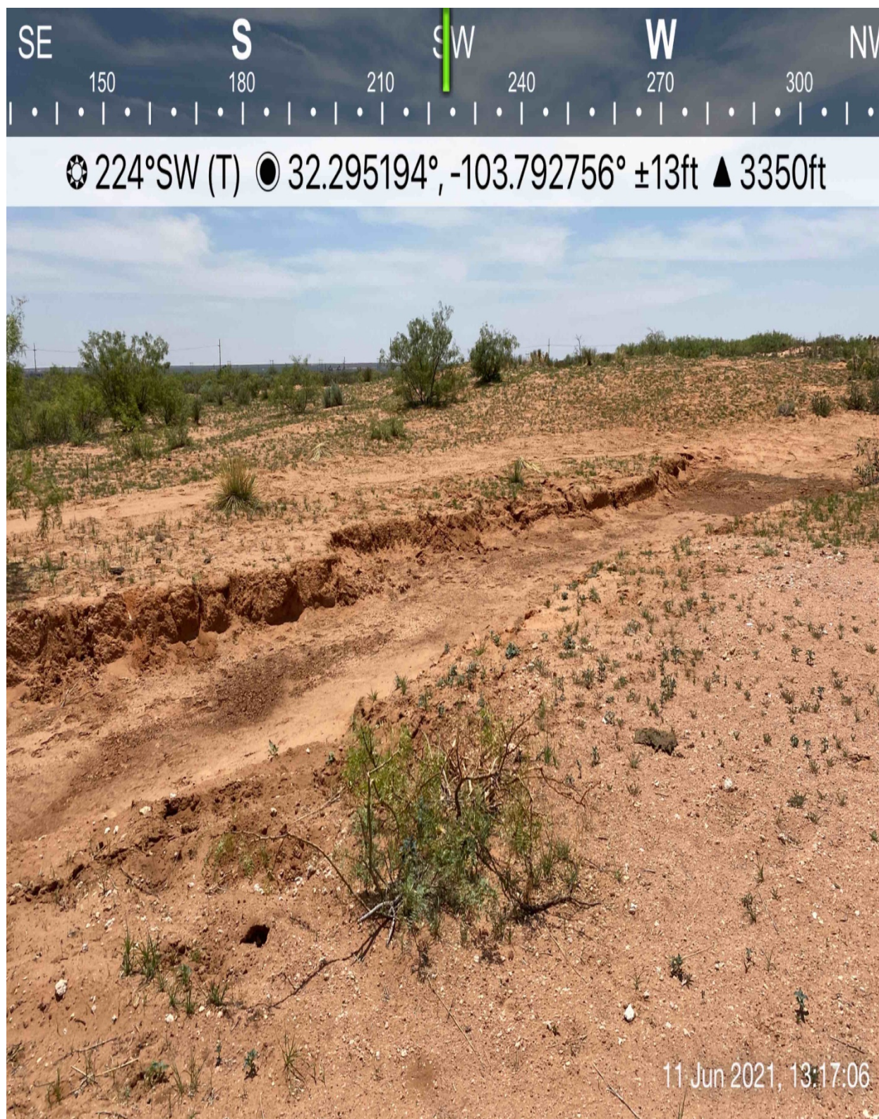
Excavated Distal End of the Pasture Release Area Looking to the Southwest

OXY Pure Gold B Federal 10 - Coordinates 32.295006 N, -103.792038 W - Incident ID # nAPP2102858169