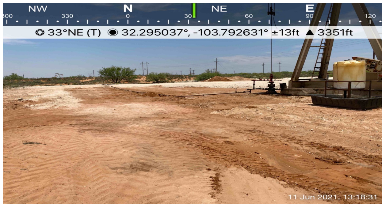
Excavated Northern Portion of the Release, West Sid of the Pumpjack and Overspray Area looking Northeasterly

OXY Pure Gold B Federal 10 - Coordinates 32.295006 N, -103.792038 W - Incident ID # nAPP2102858169