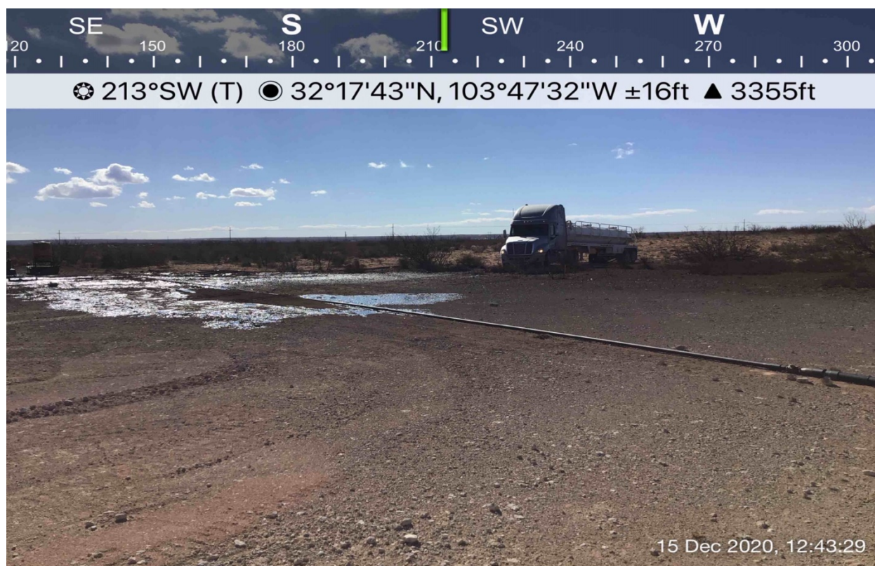
Overspray and Pooled Crude Oil on the Pad Looking South-Southwest