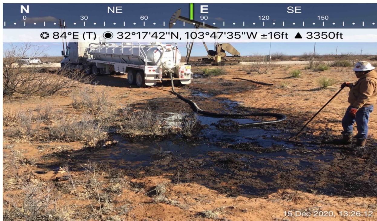
Distal Pasture Release Area Showing Pooled Crude Oil Looking Just North of East