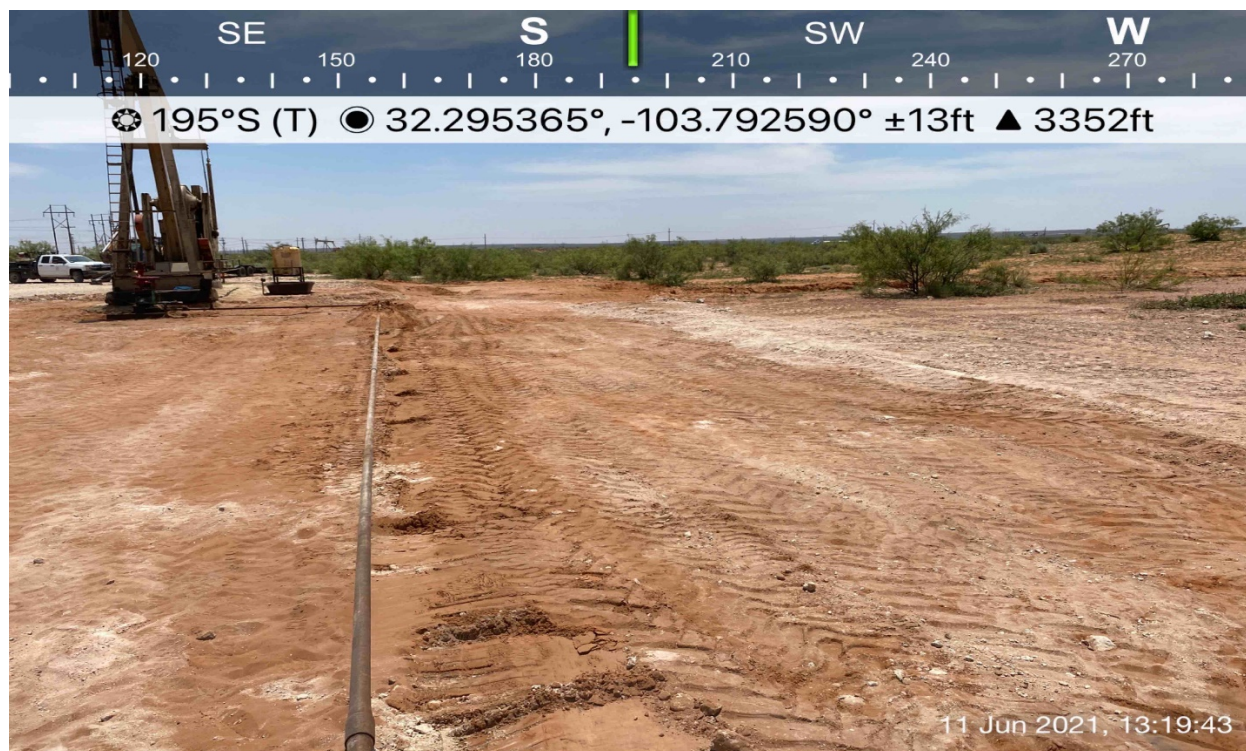
Excavated Impacted Pad and Overspray Area Looking South-Southwest