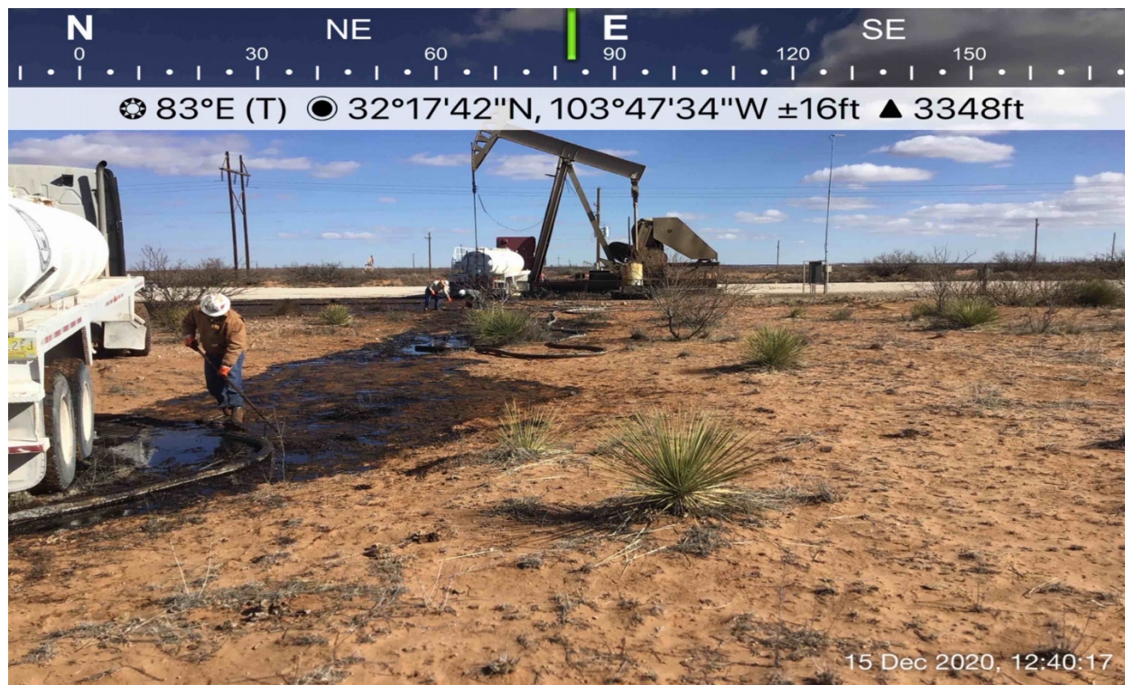
Release Area Showing Pooled Crude Oil and Overspray Looking Just North of East

OXY Pure Gold B Federal 10 - Coordinates 32.295006 N, -103.792038 W - Incident ID # nAPP2102858169