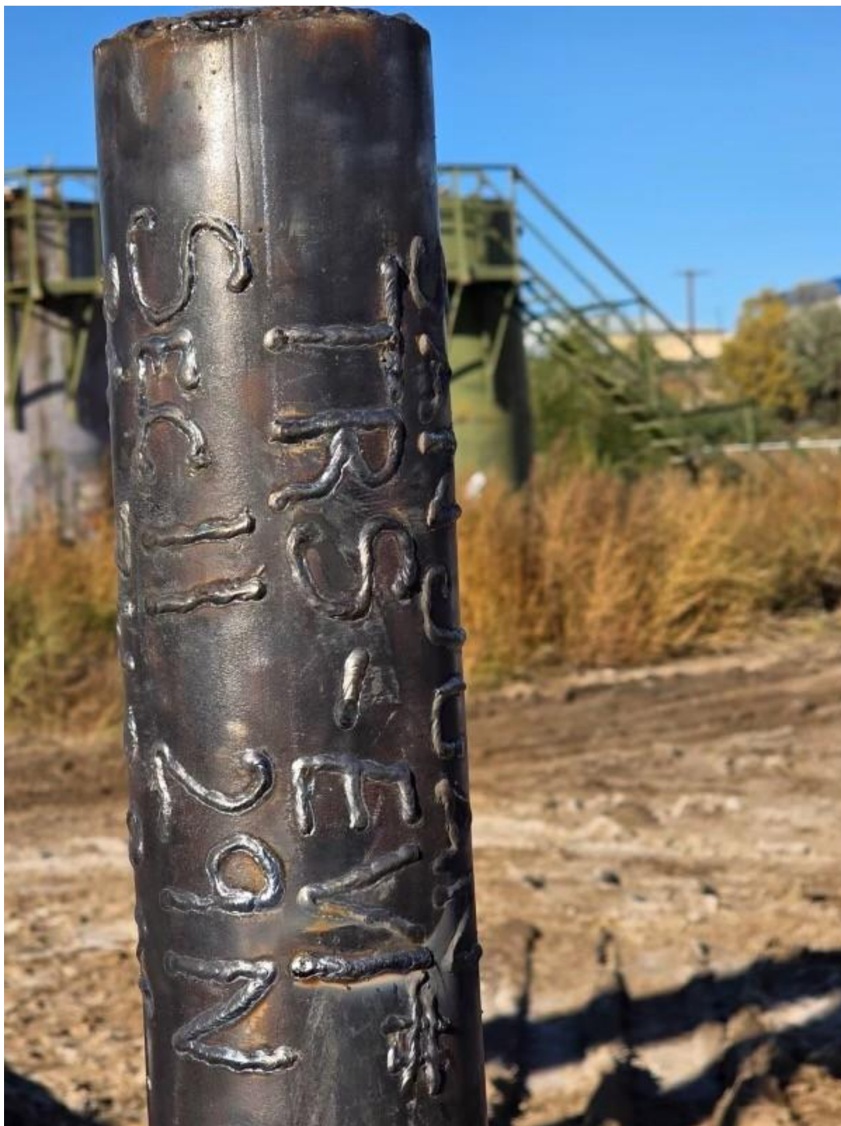
Figure 3: Marker