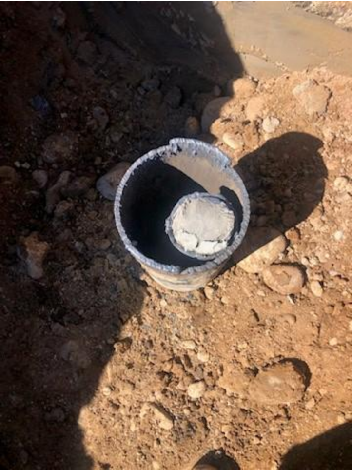
Figure 1: Cut Off