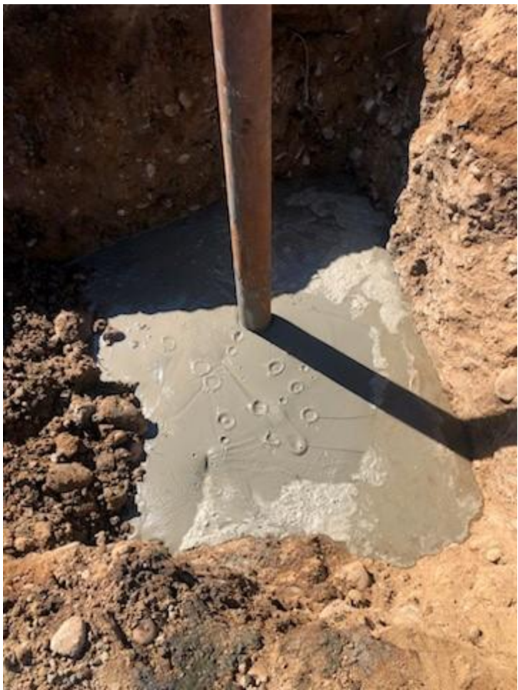
Figure 4: Top Off