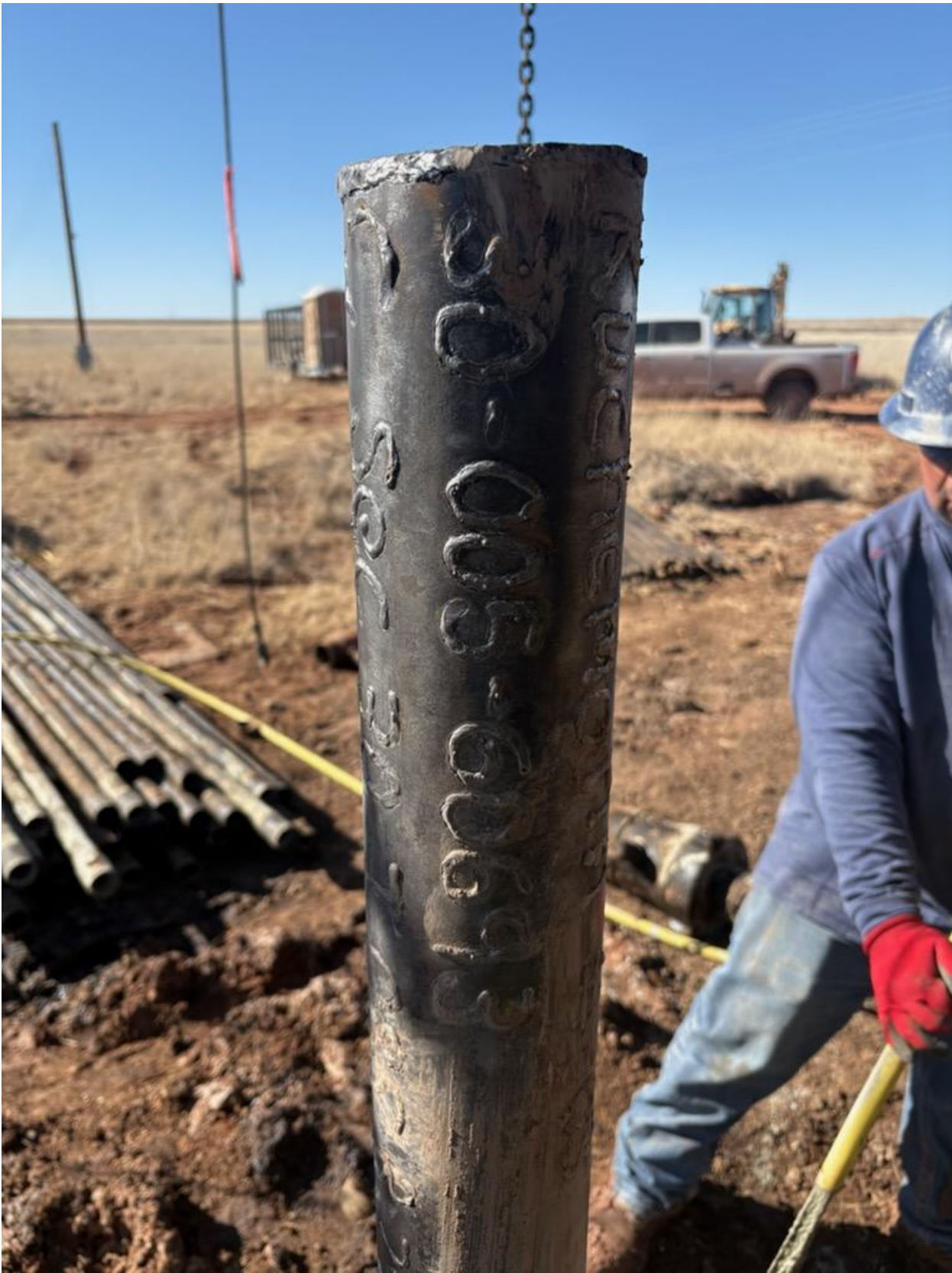
Figure 6: Marker III