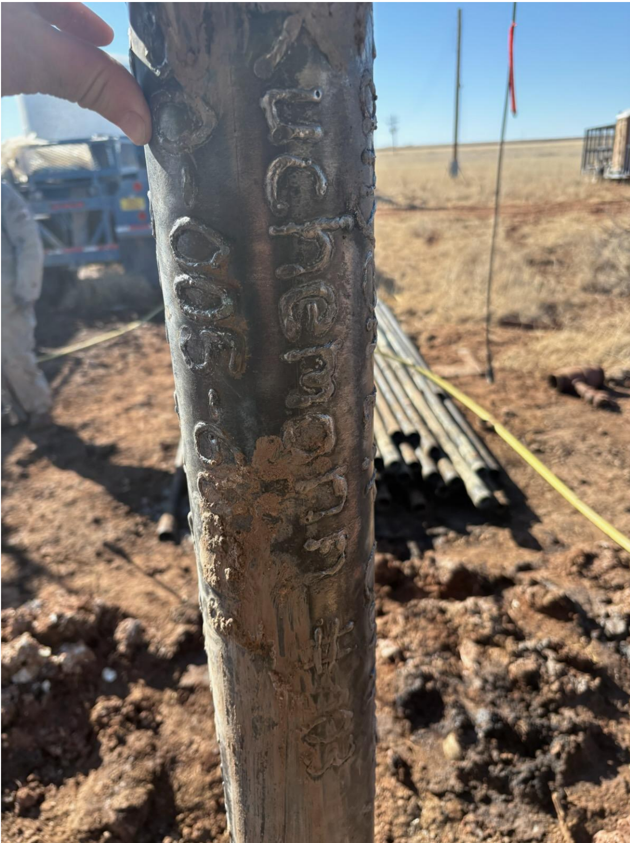
Figure 4: Marker I