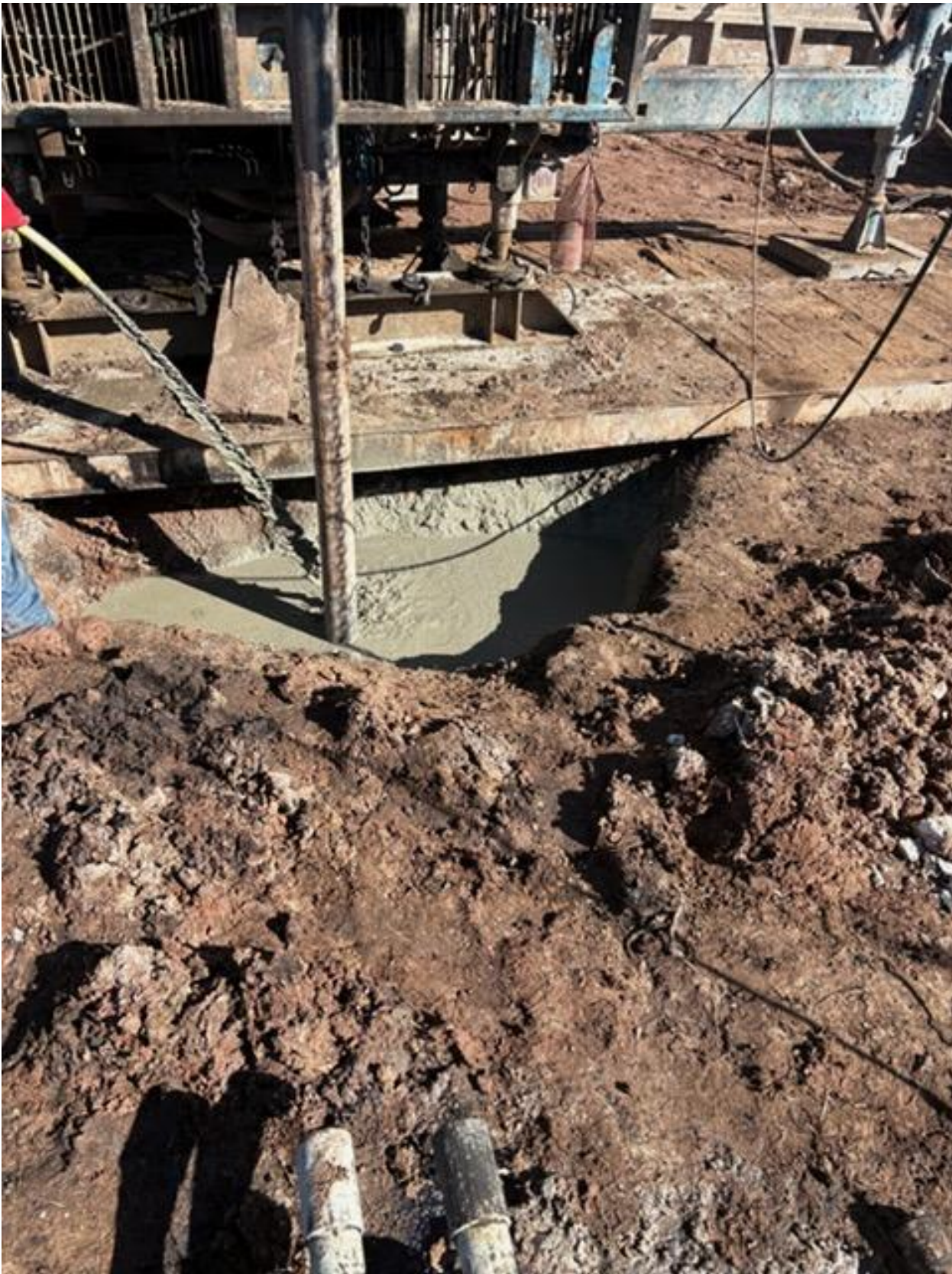
Figure 3: Top Off II