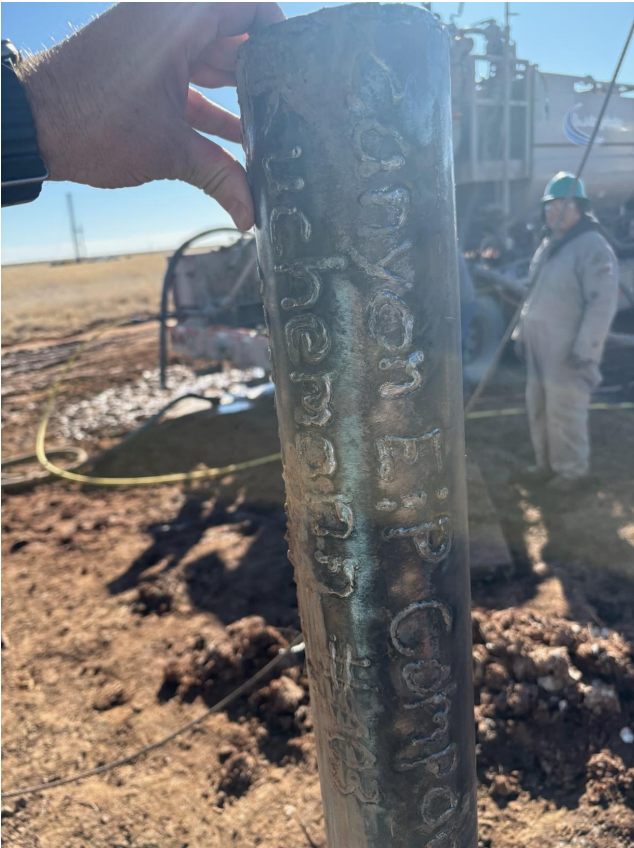
Figure 5: Marker II