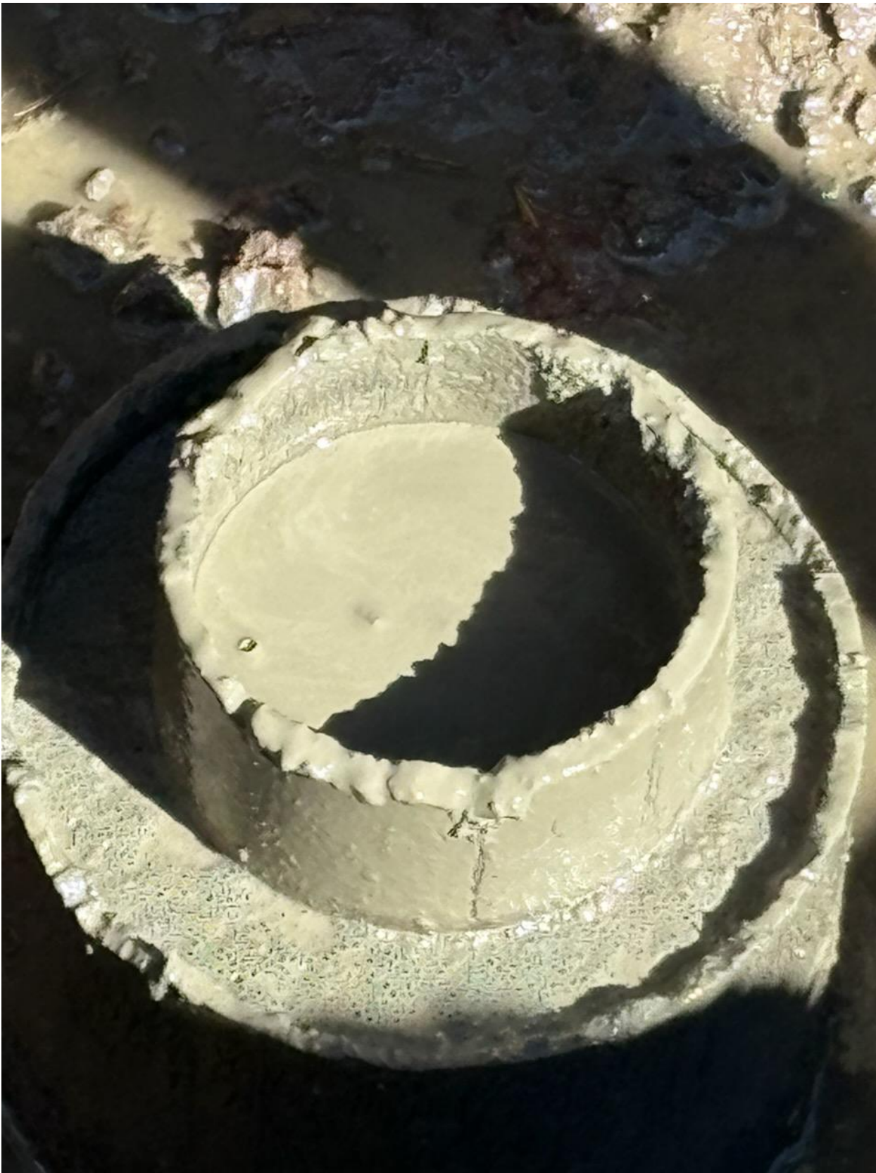
Figure 1: Top Off