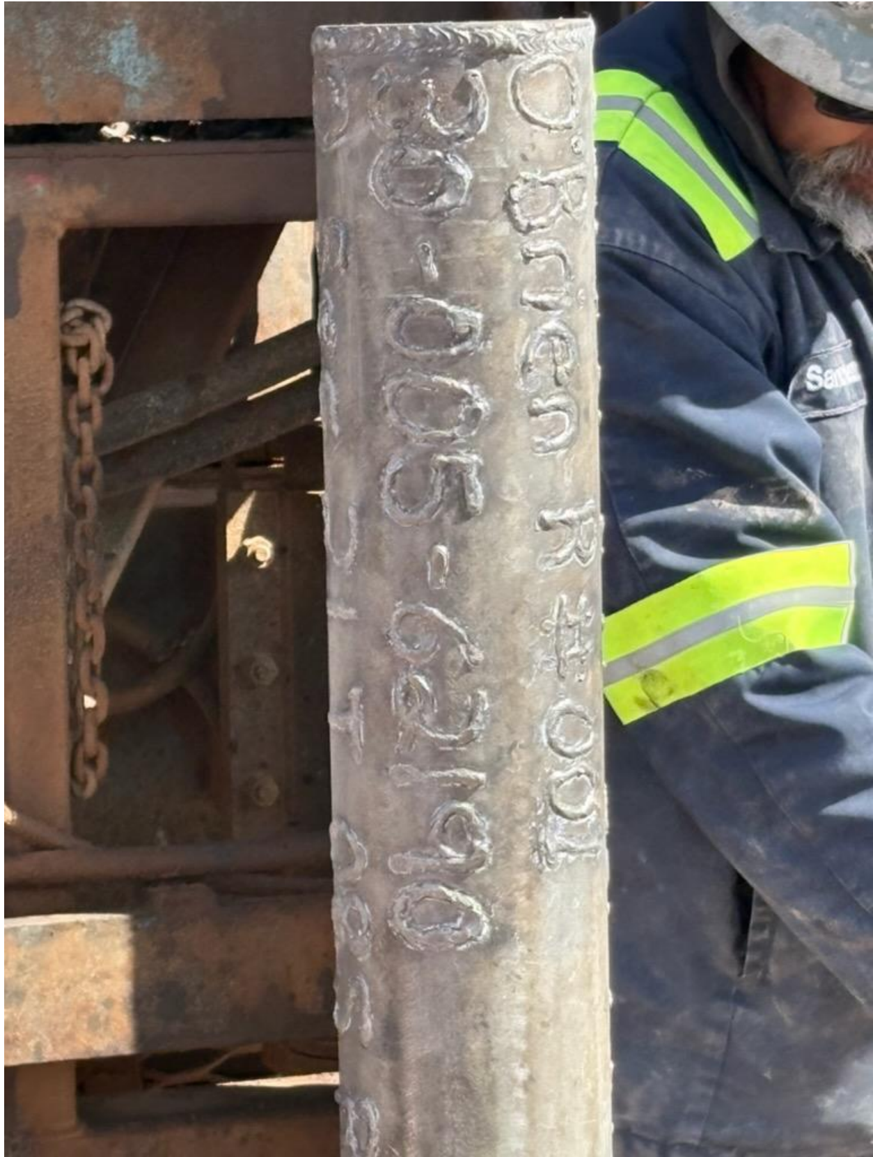
Figure 2: Marker II