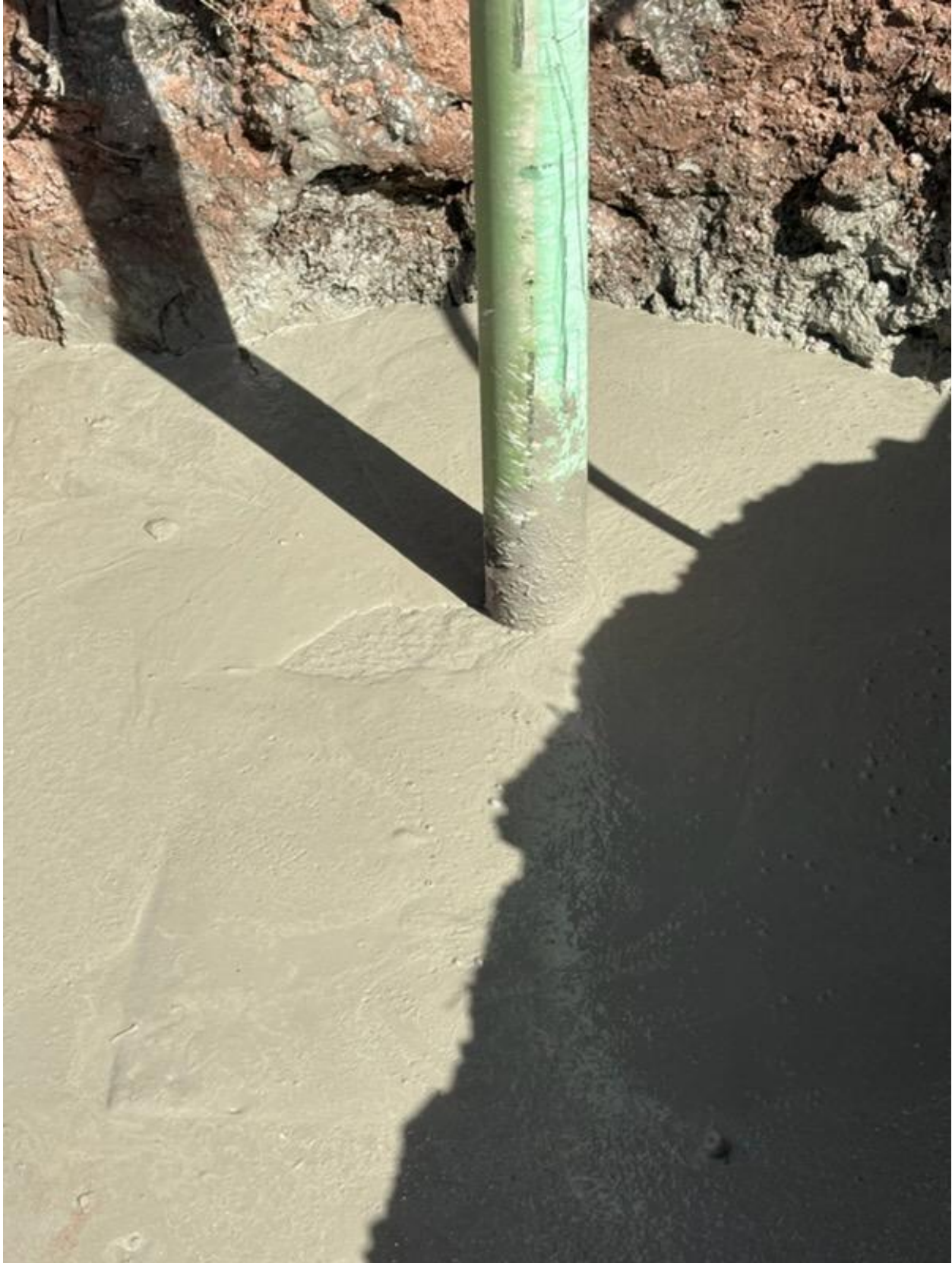
Figure 3: Top Off