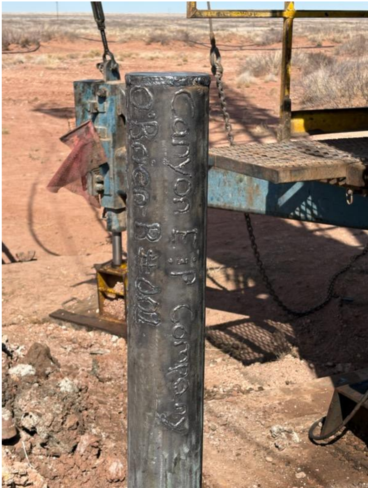
Figure 1: Marker