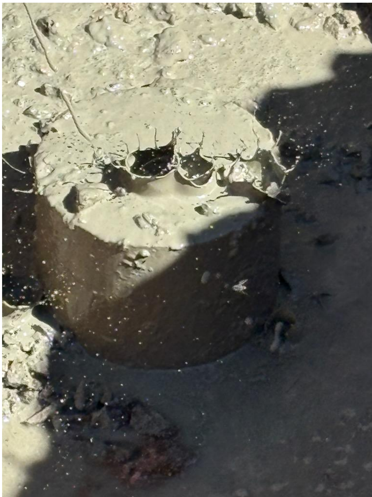
Figure 4: Top Off II