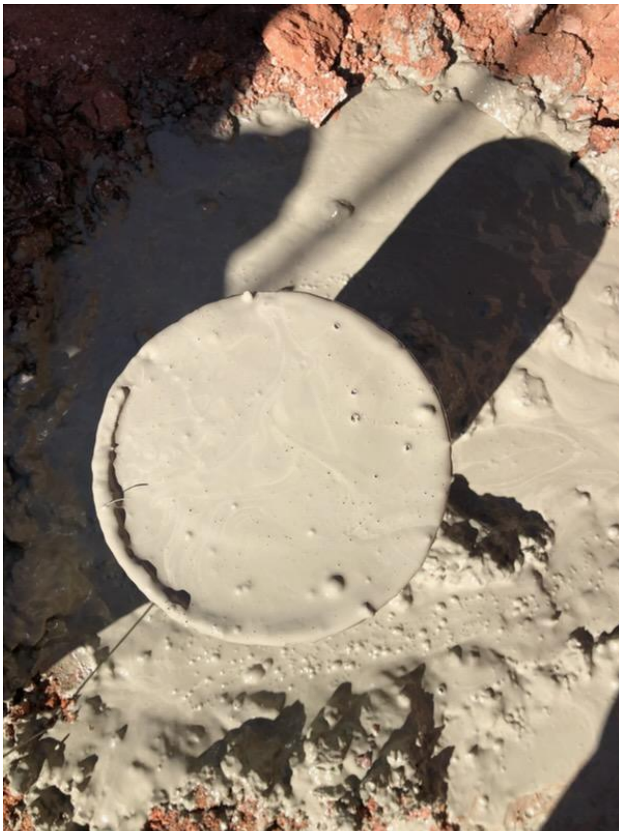
Figure 2: Top Off