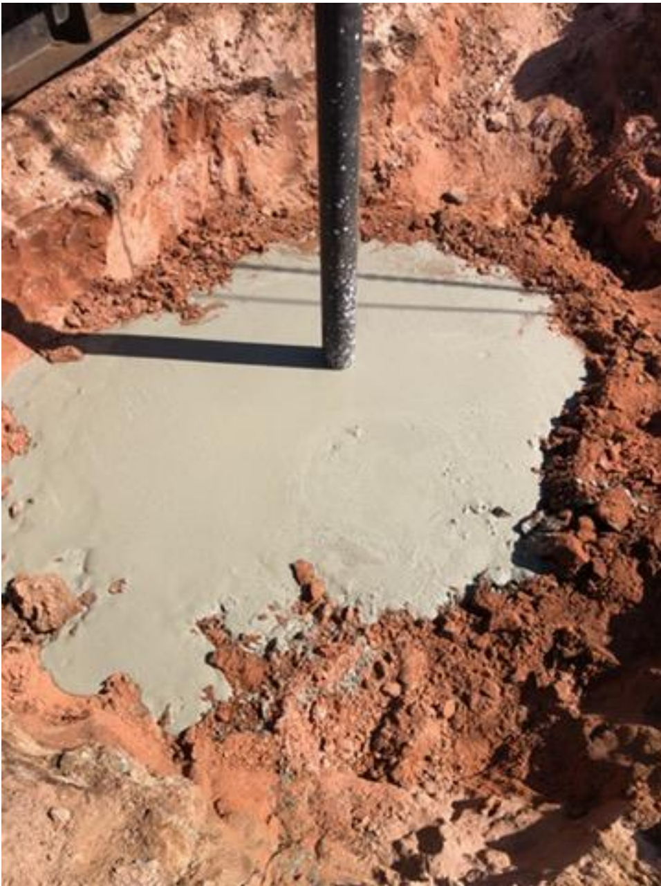
Figure 4: Top Off II