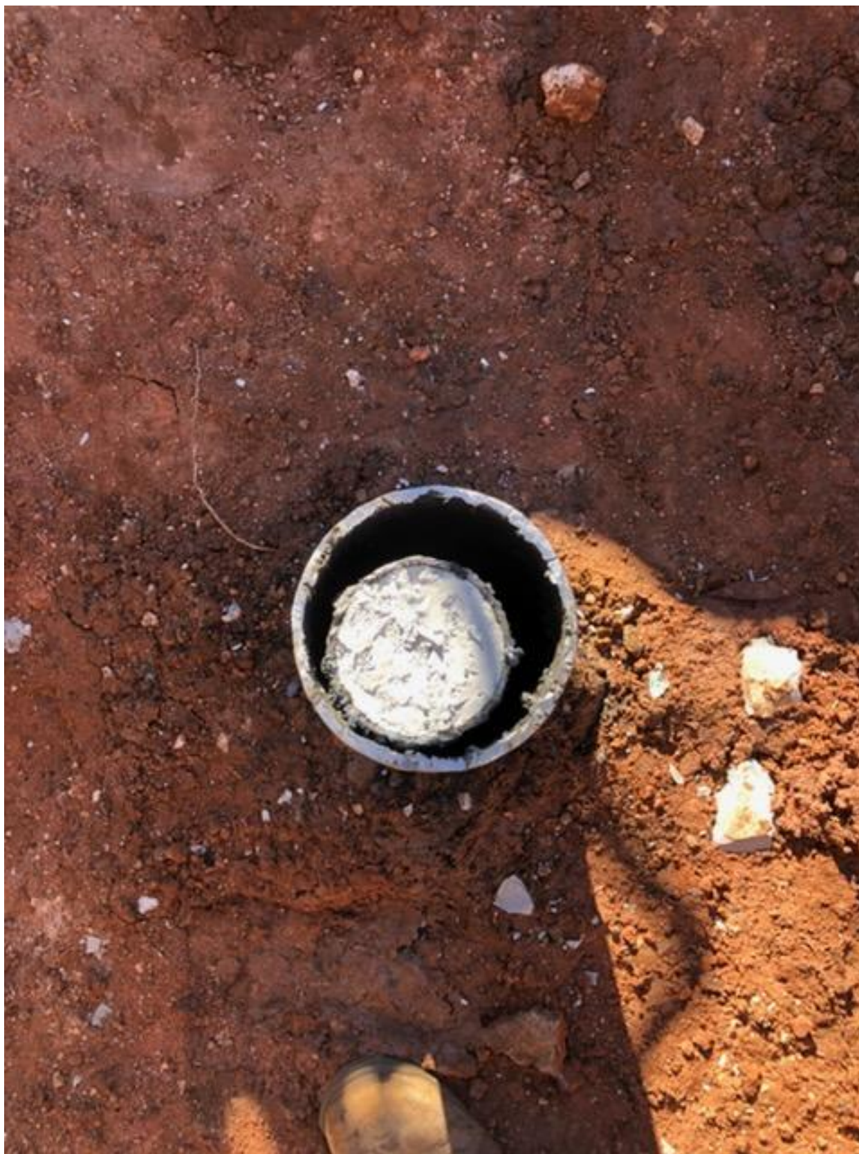
Figure 1: Cut Off