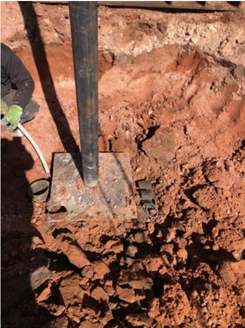
Figure 3: Marker I