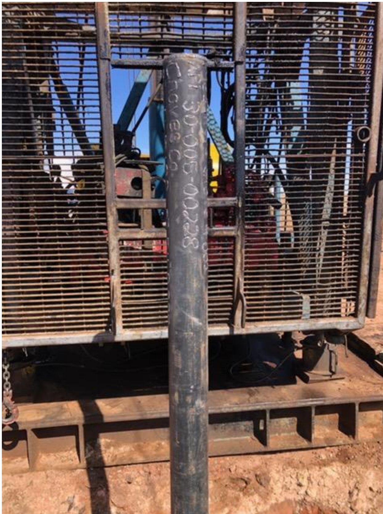
Figure 5: Marker II