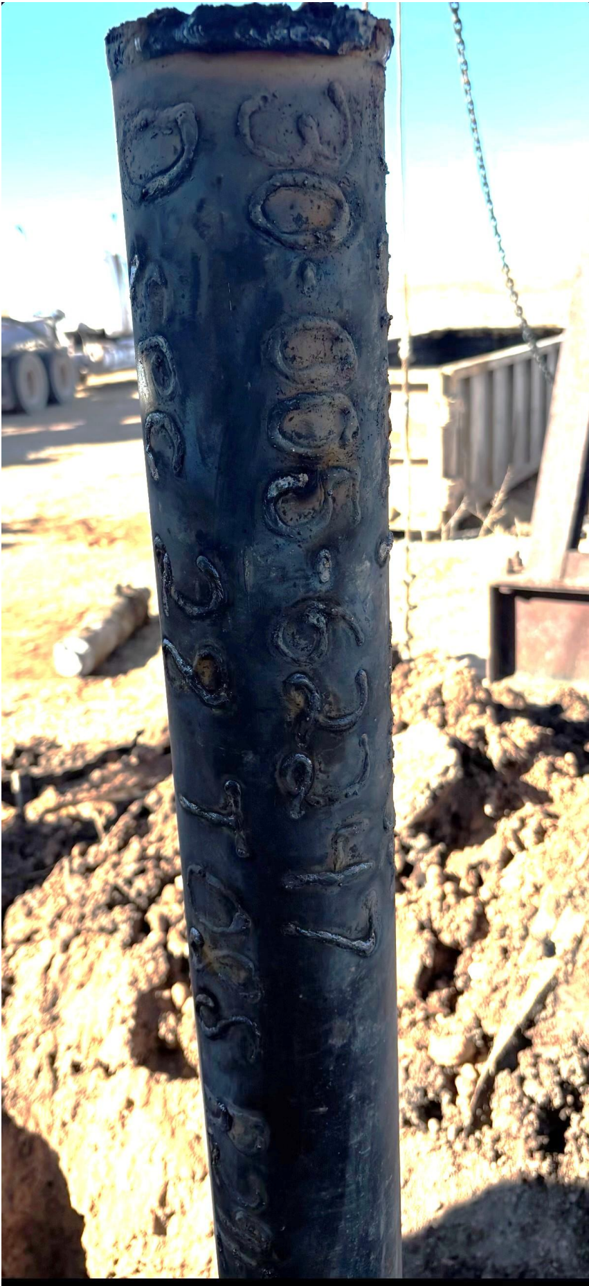
Figure 2: API