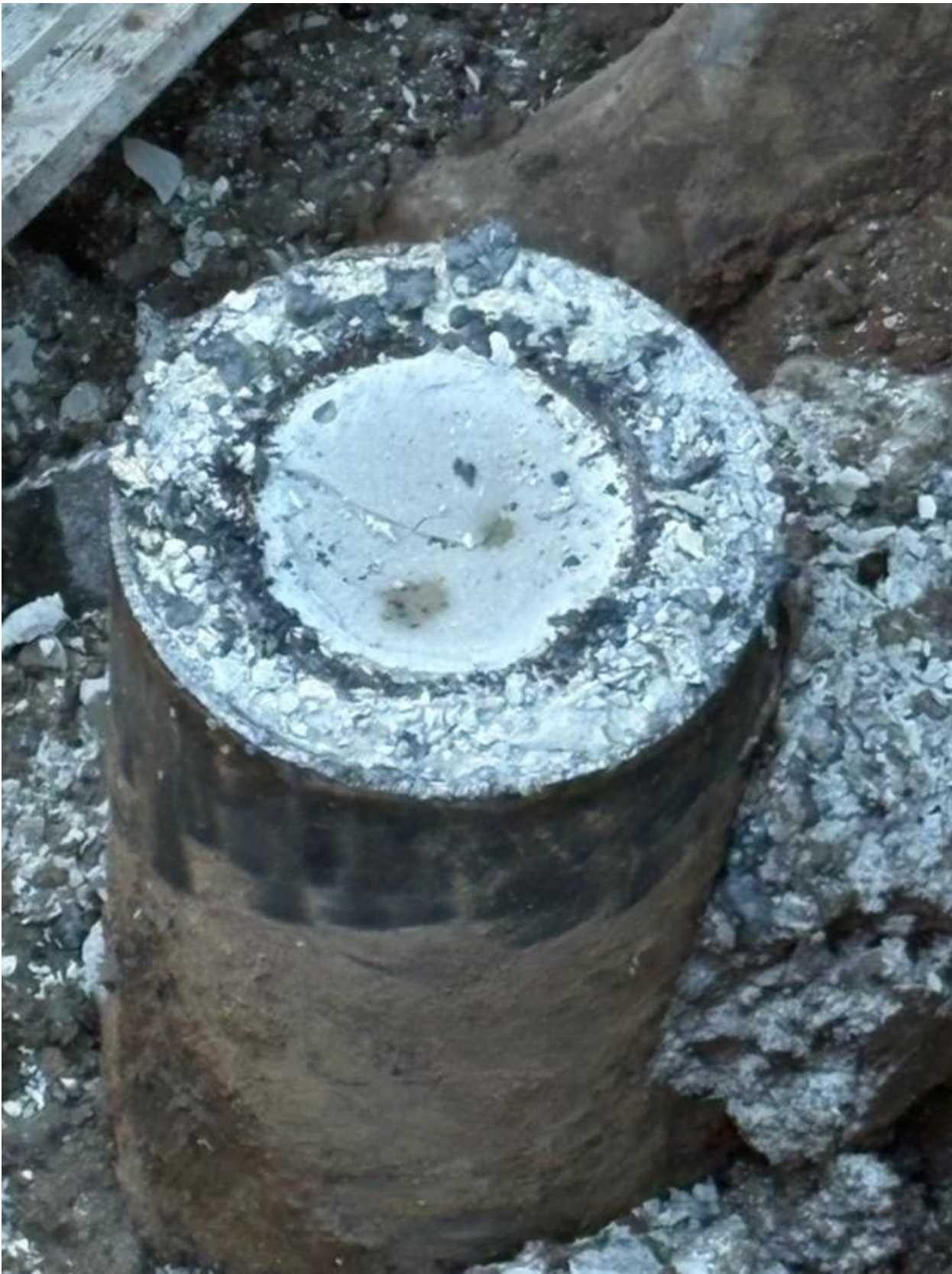
Figure 5: Cut Off