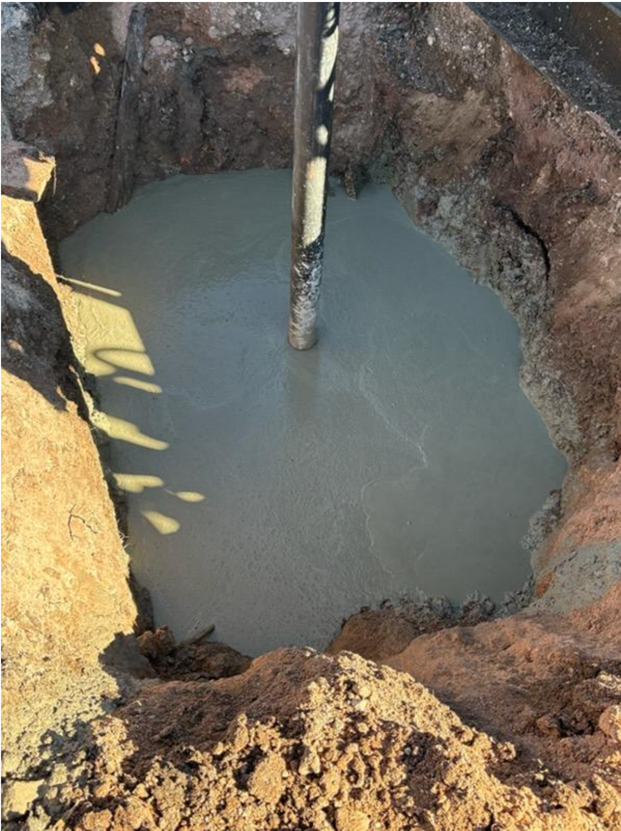
Figure 4: Top Off