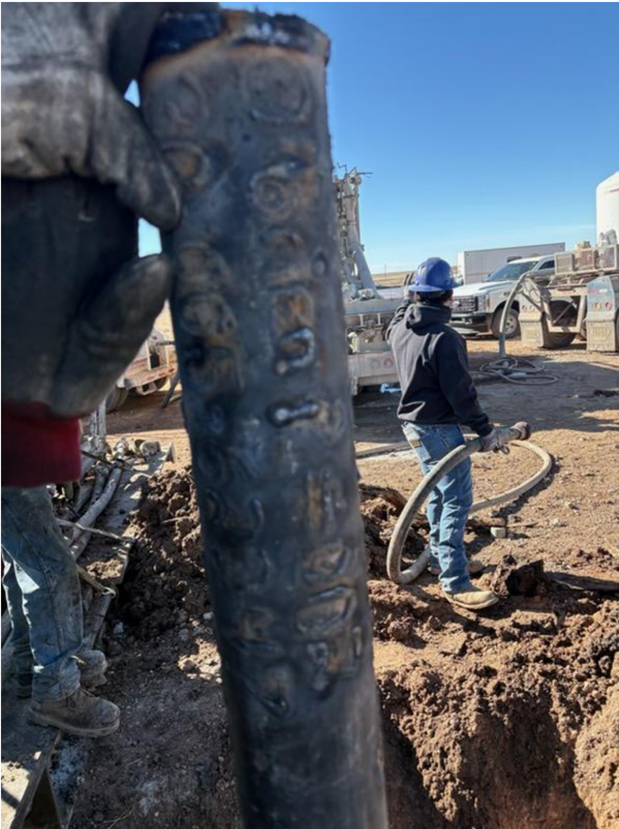
Figure 3: Marker