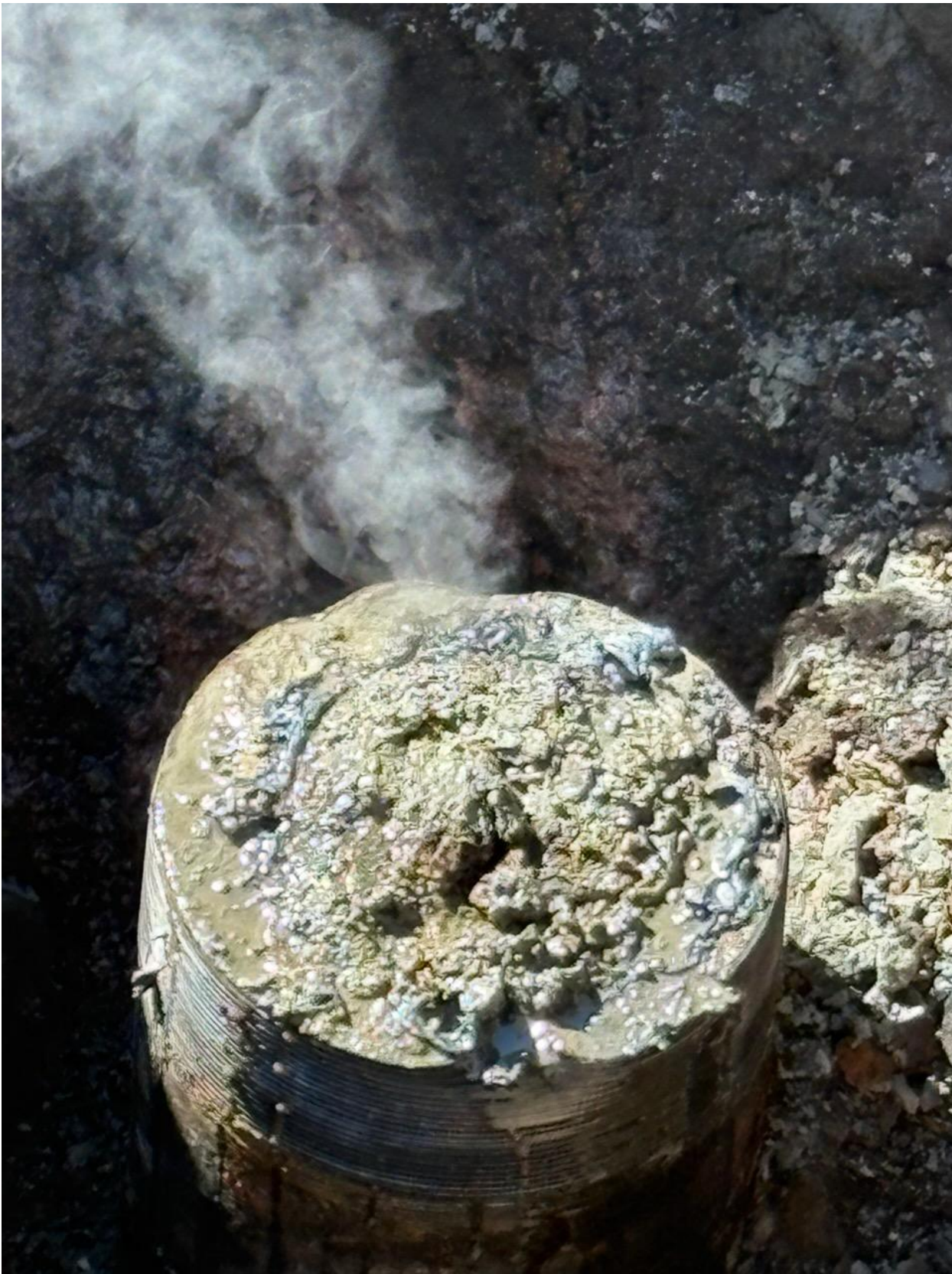
Figure 1: Cut Off