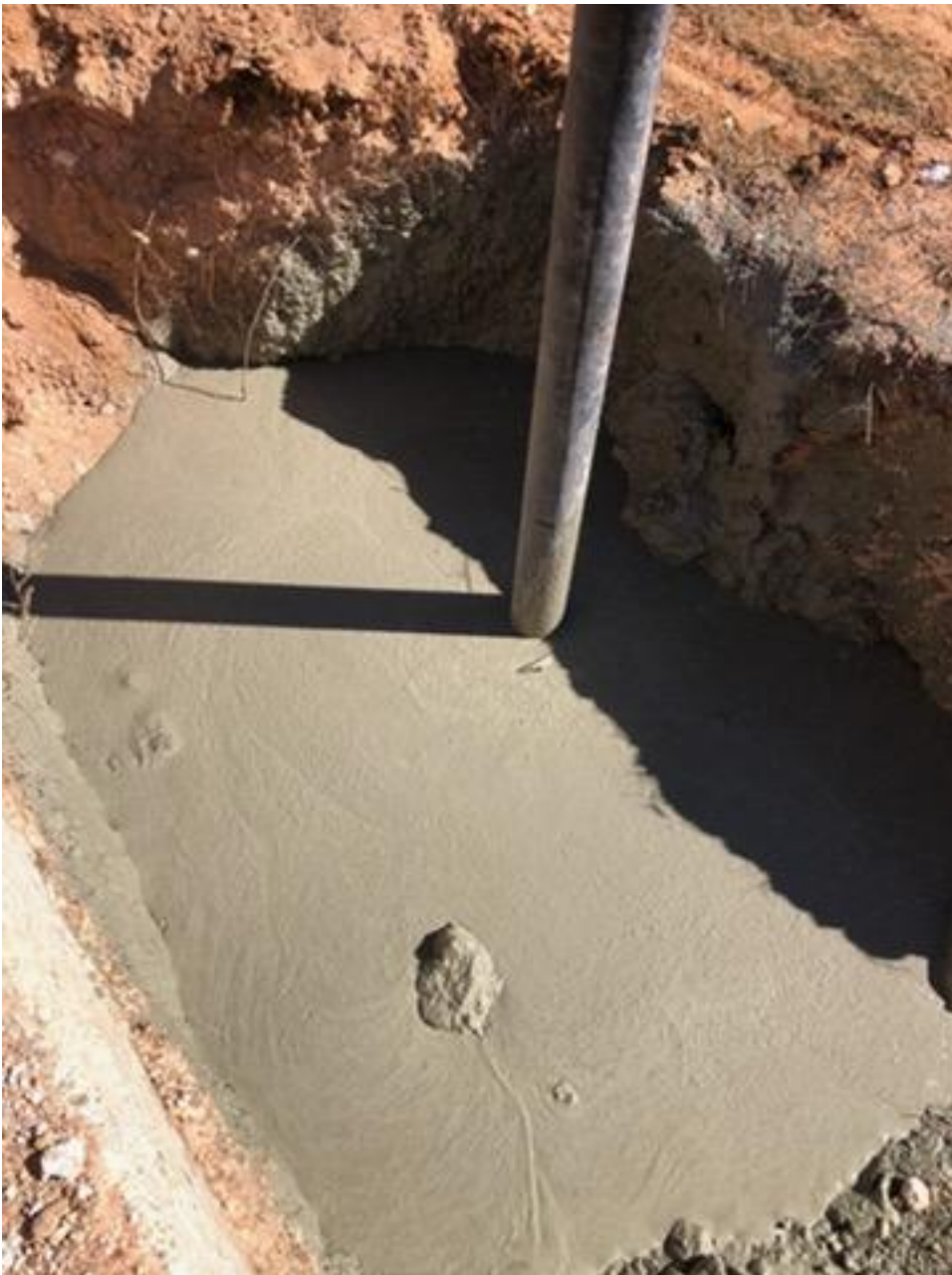
Figure 4: Top Off