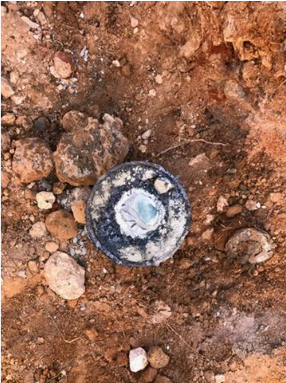
Figure 1: Cut Off