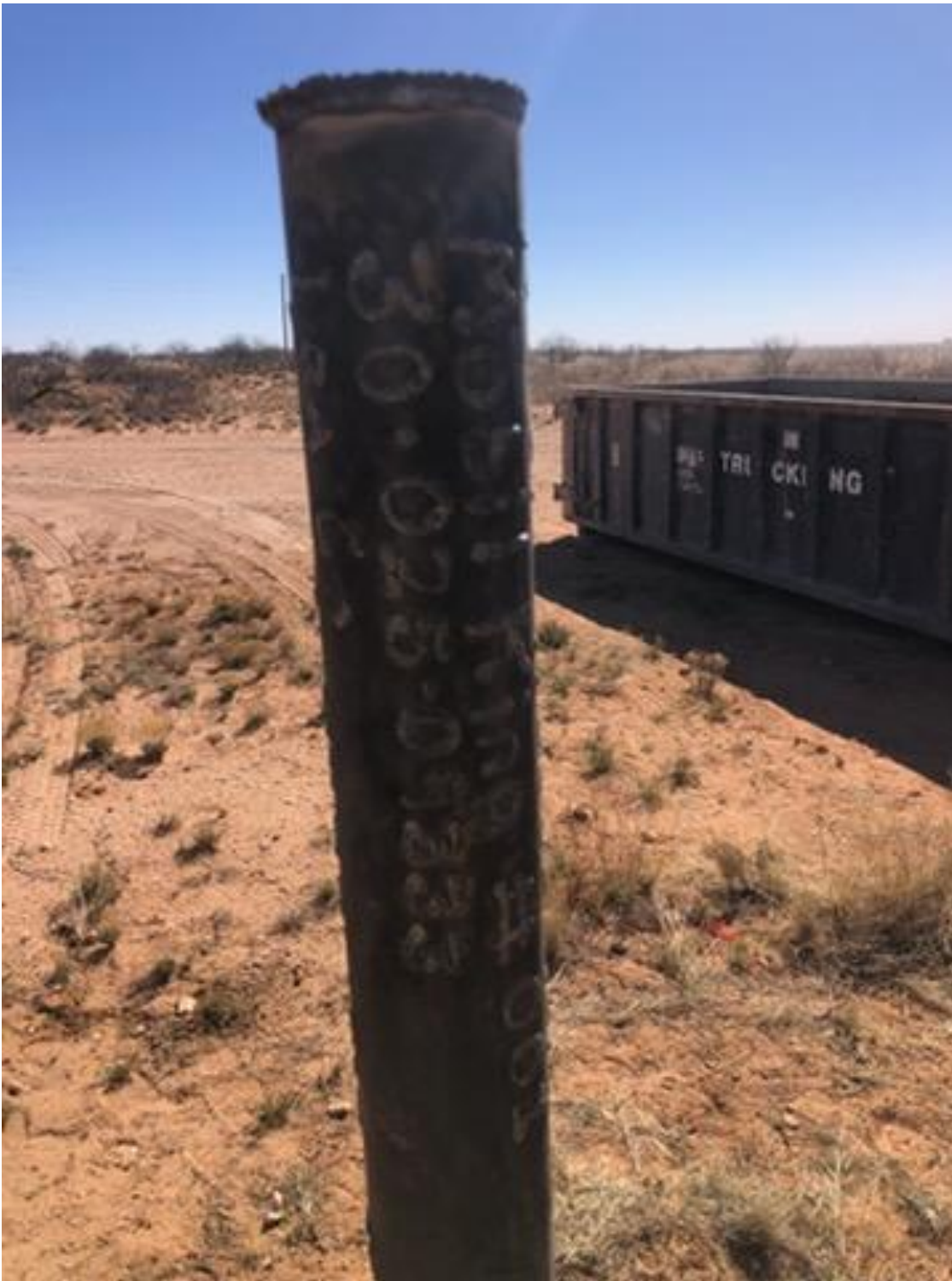
Figure 5: Marker