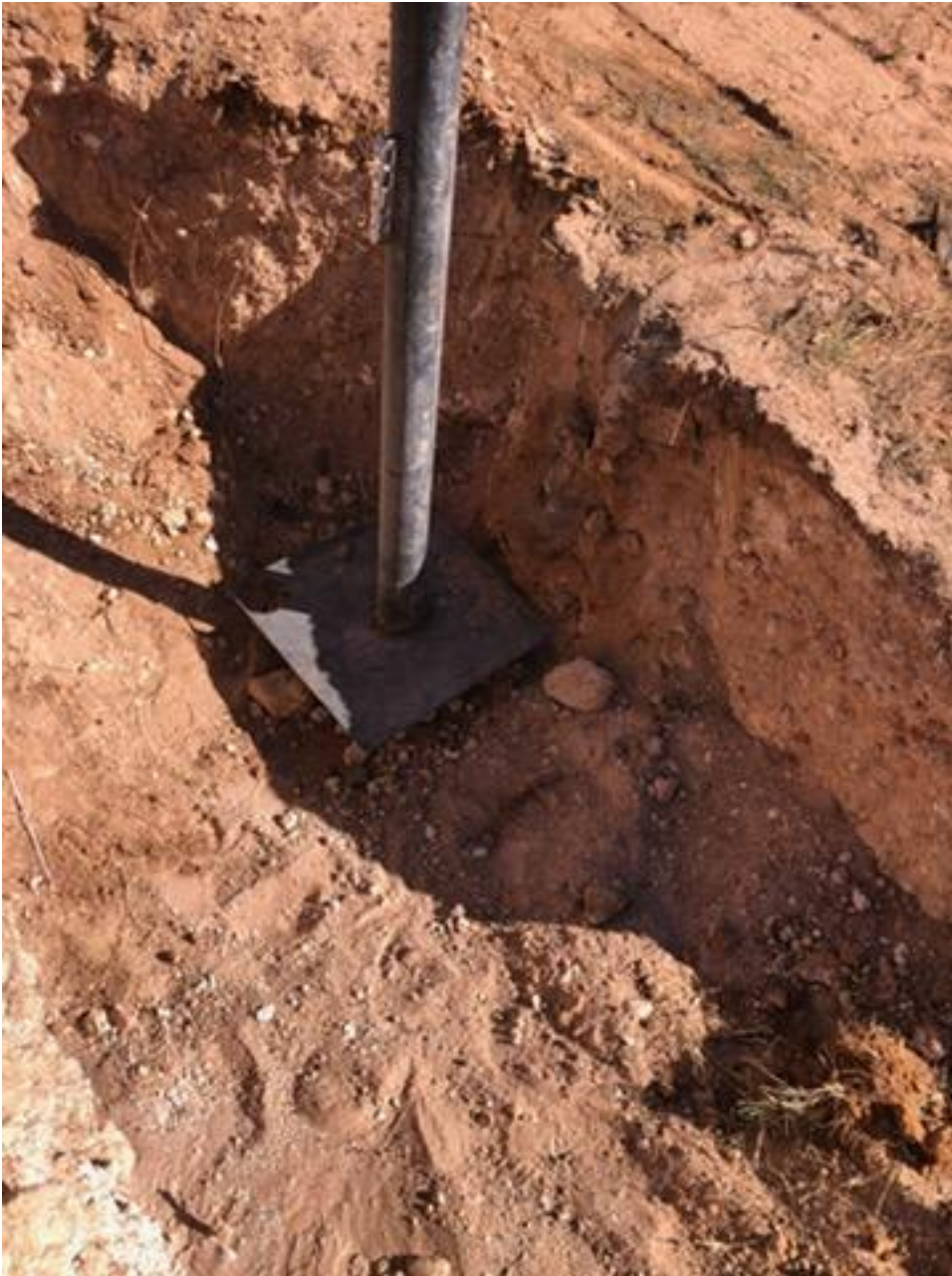
Figure 3: Marker