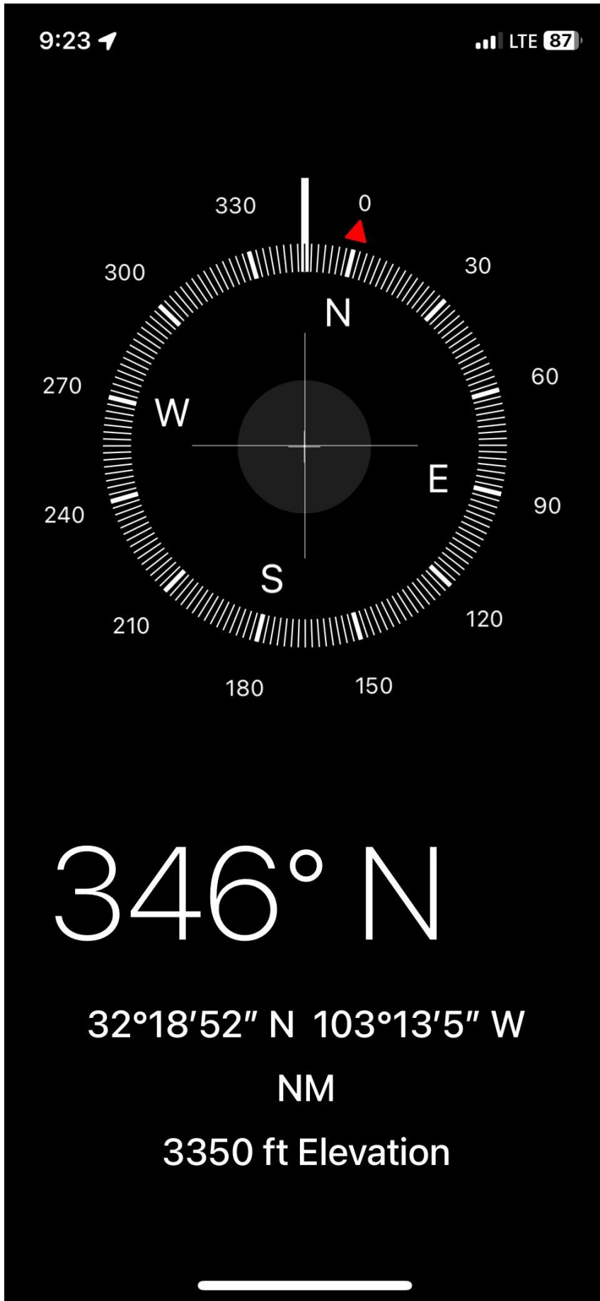
Figure 2: GPS