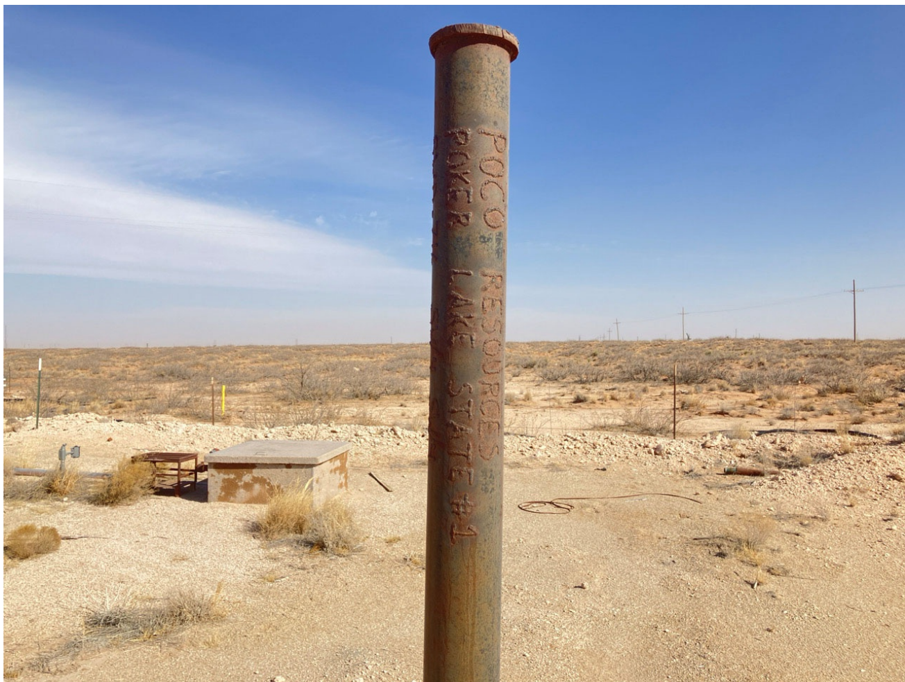
Poker Lake State #001 (30-015-04744); Dry Hole Marker