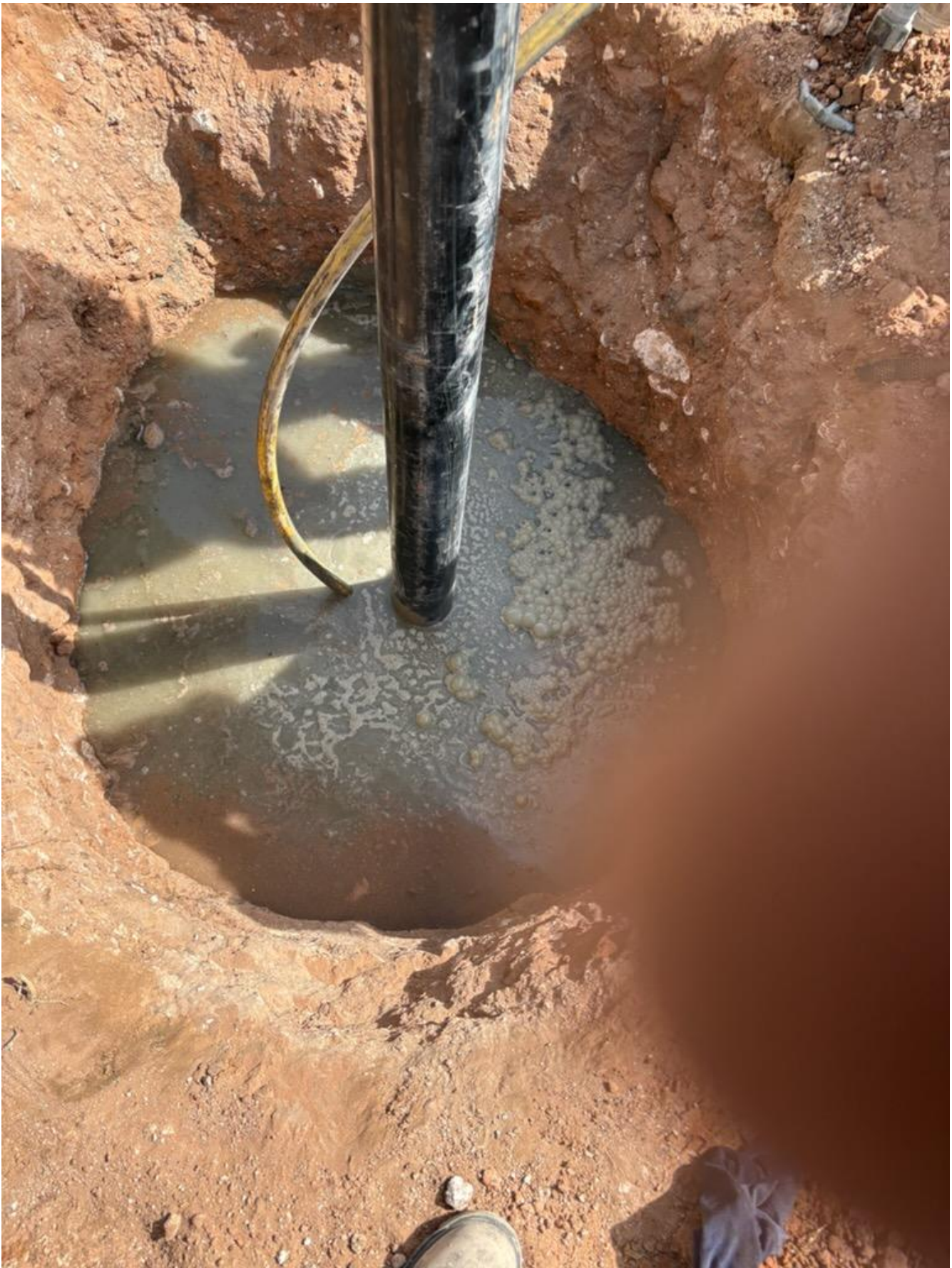
Figure 3: Top Off