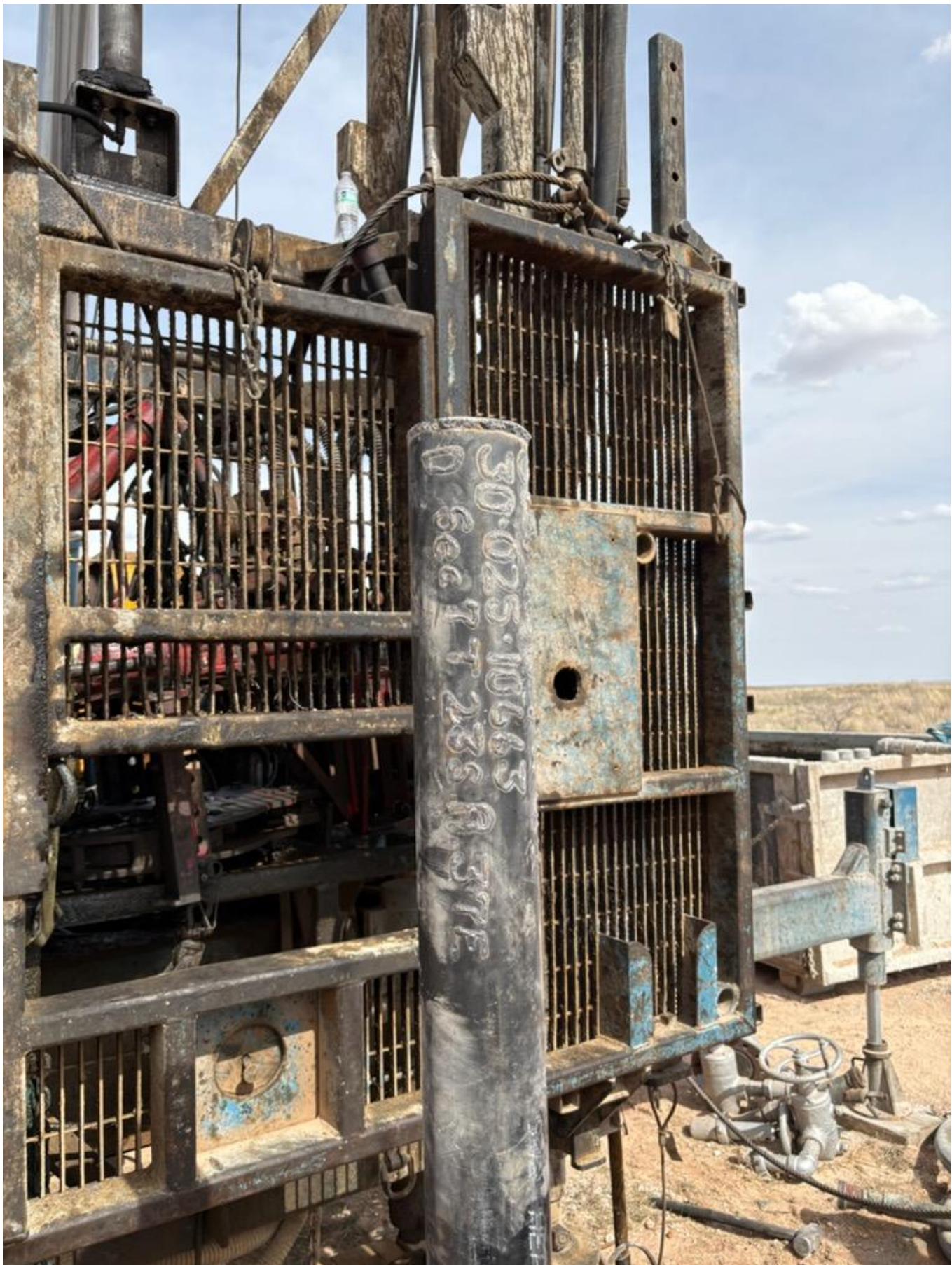
Figure 1: Marker