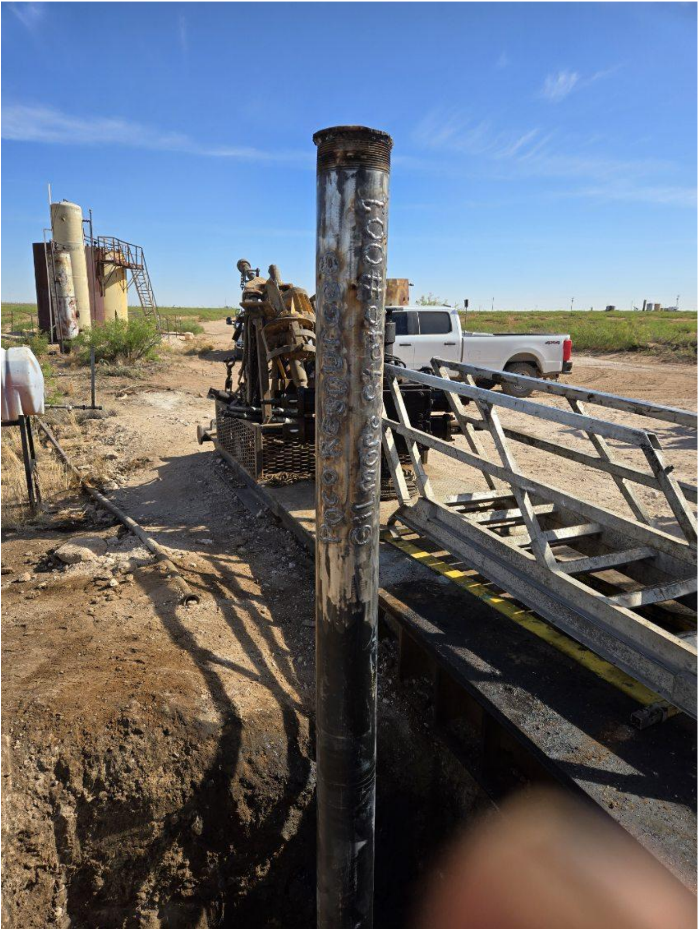
Figure 4: Marker