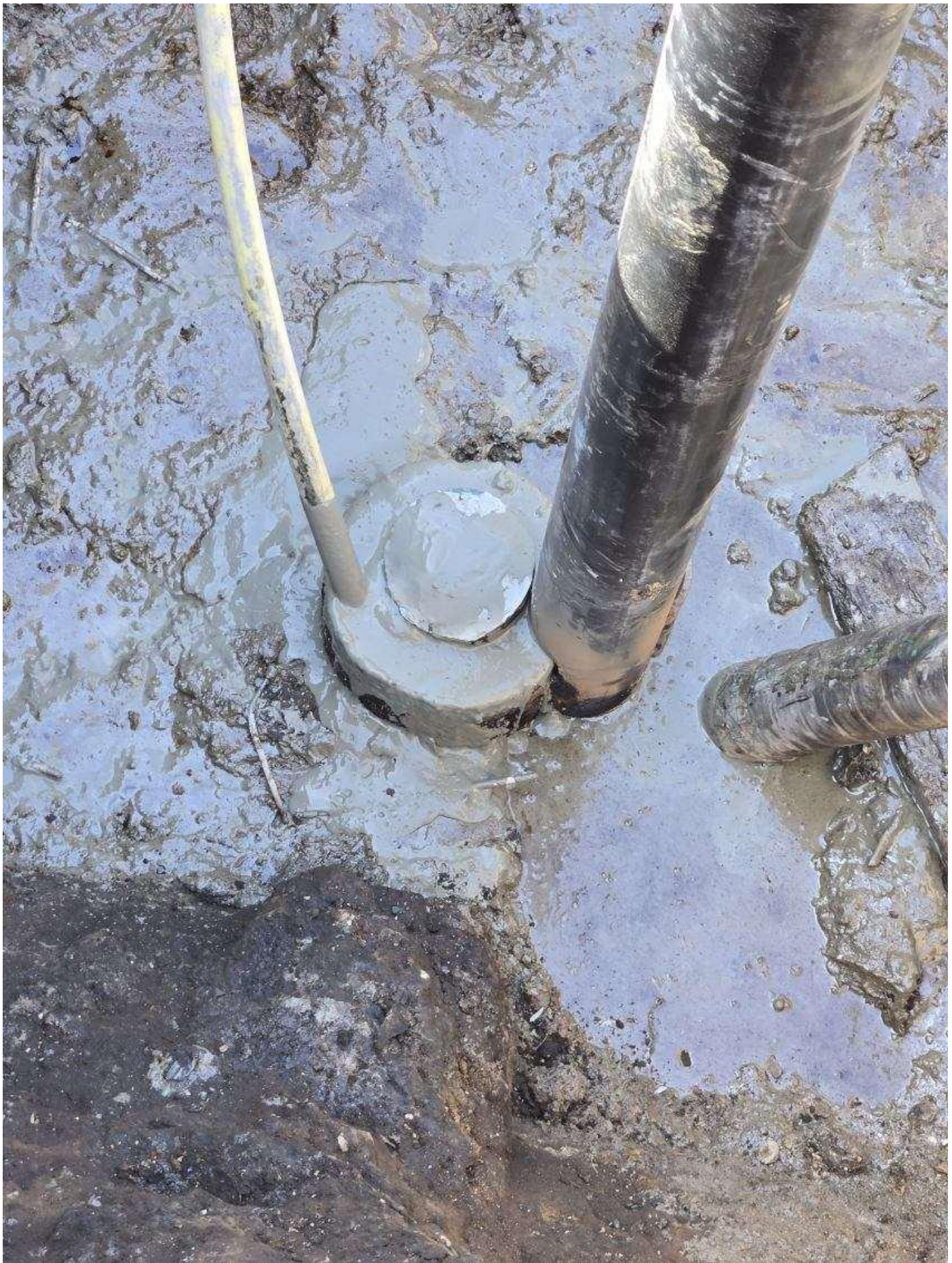
Figure 1: Top Off