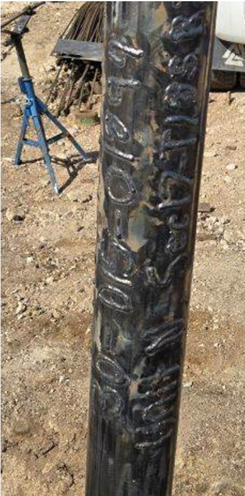
Figure 6: API Detail