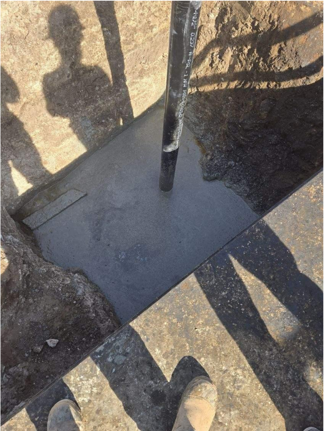
Figure 2: Top Off II