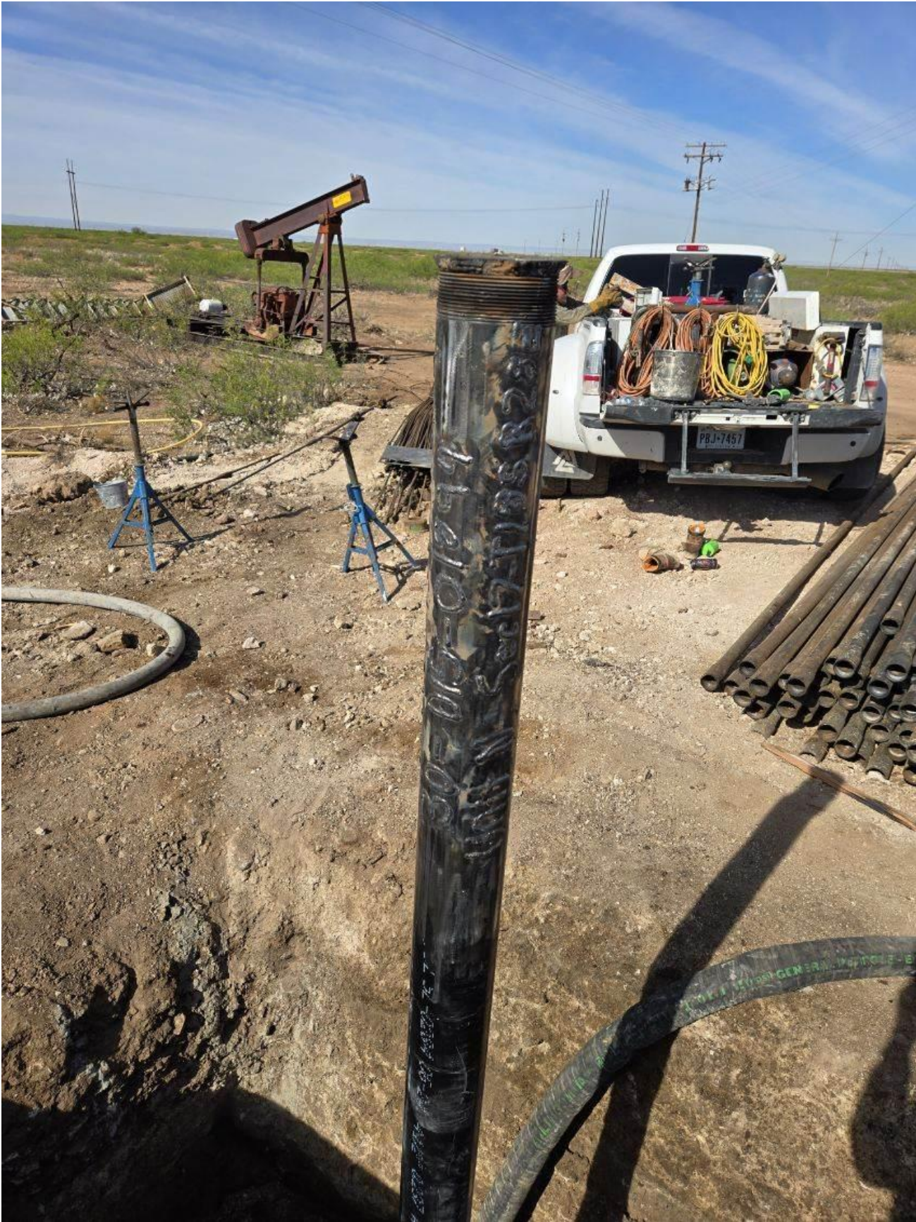
Figure 5: Marker II