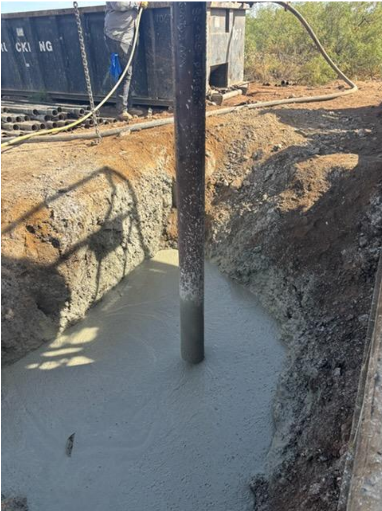
Figure 1: Cellar