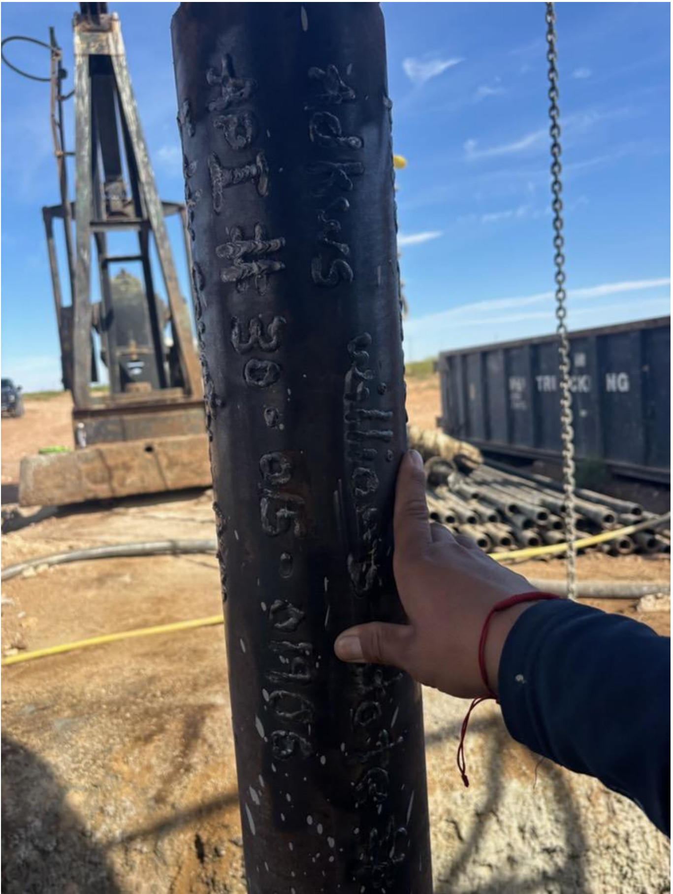
Figure 3: Marker II