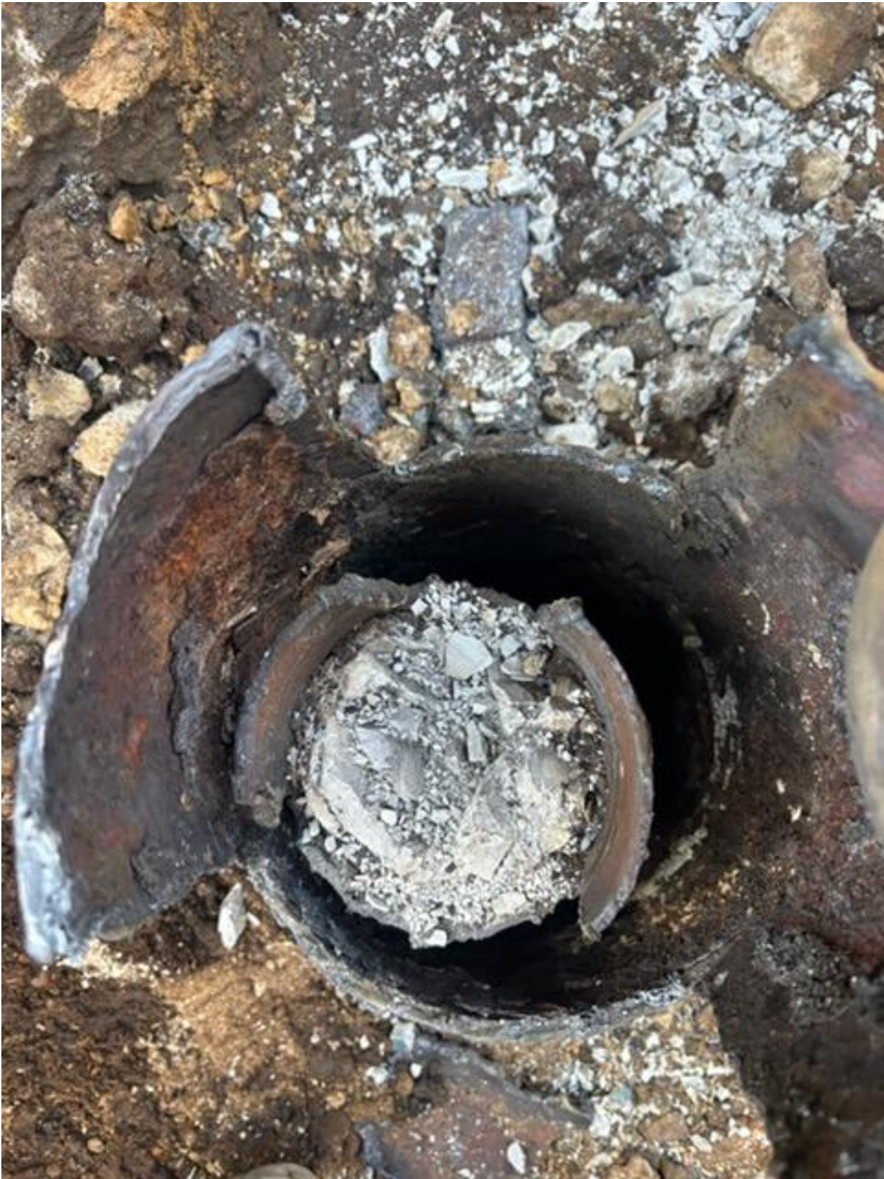
Figure 5: Cut Off