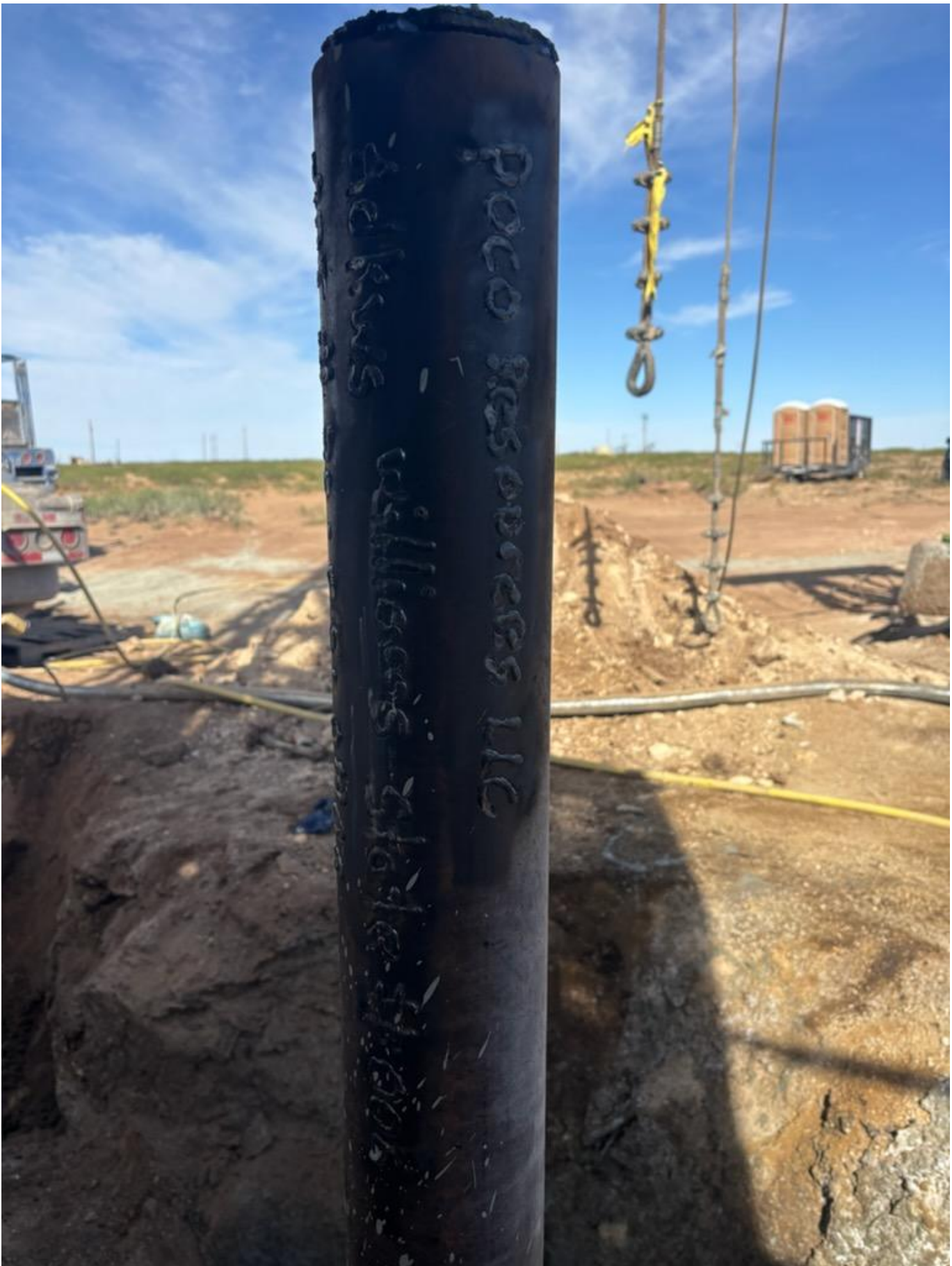
Figure 2: Marker