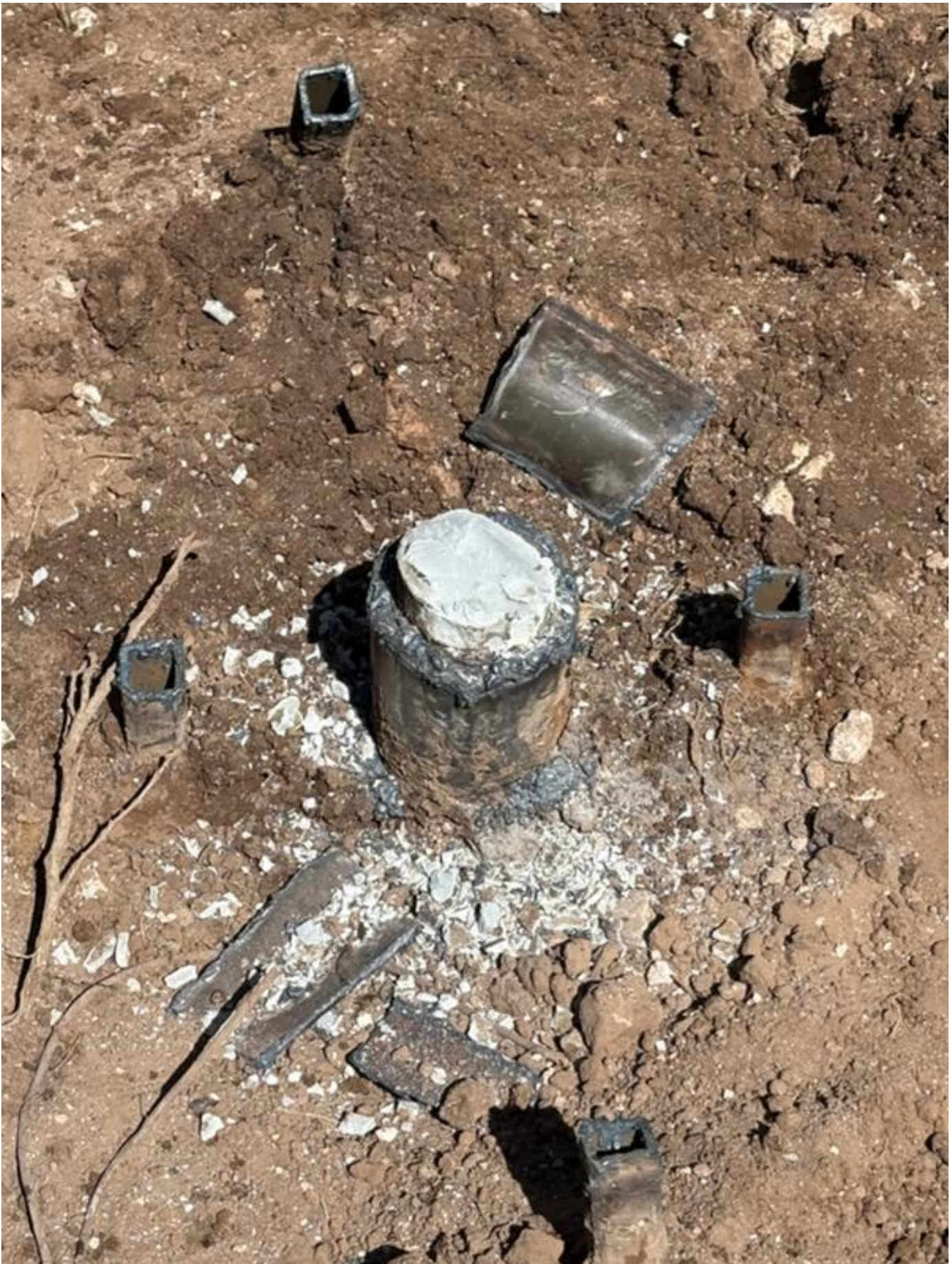
Figure 4: Cut Off