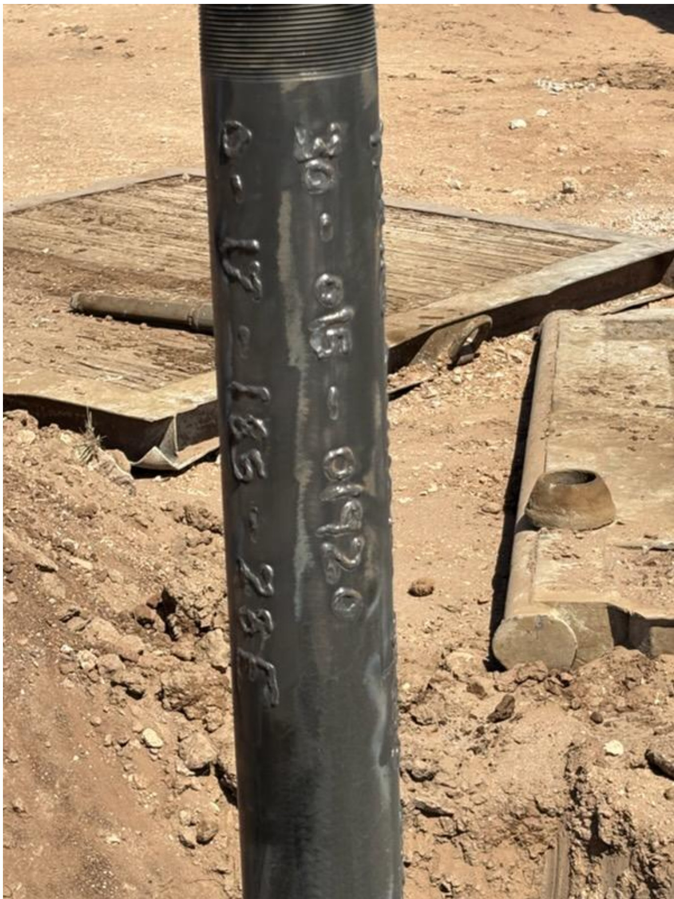
Figure 3: Marker