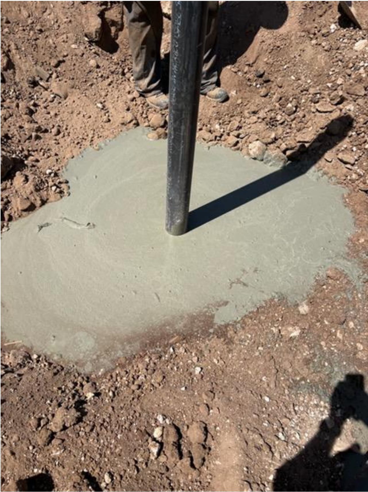
Figure 2: Top Off