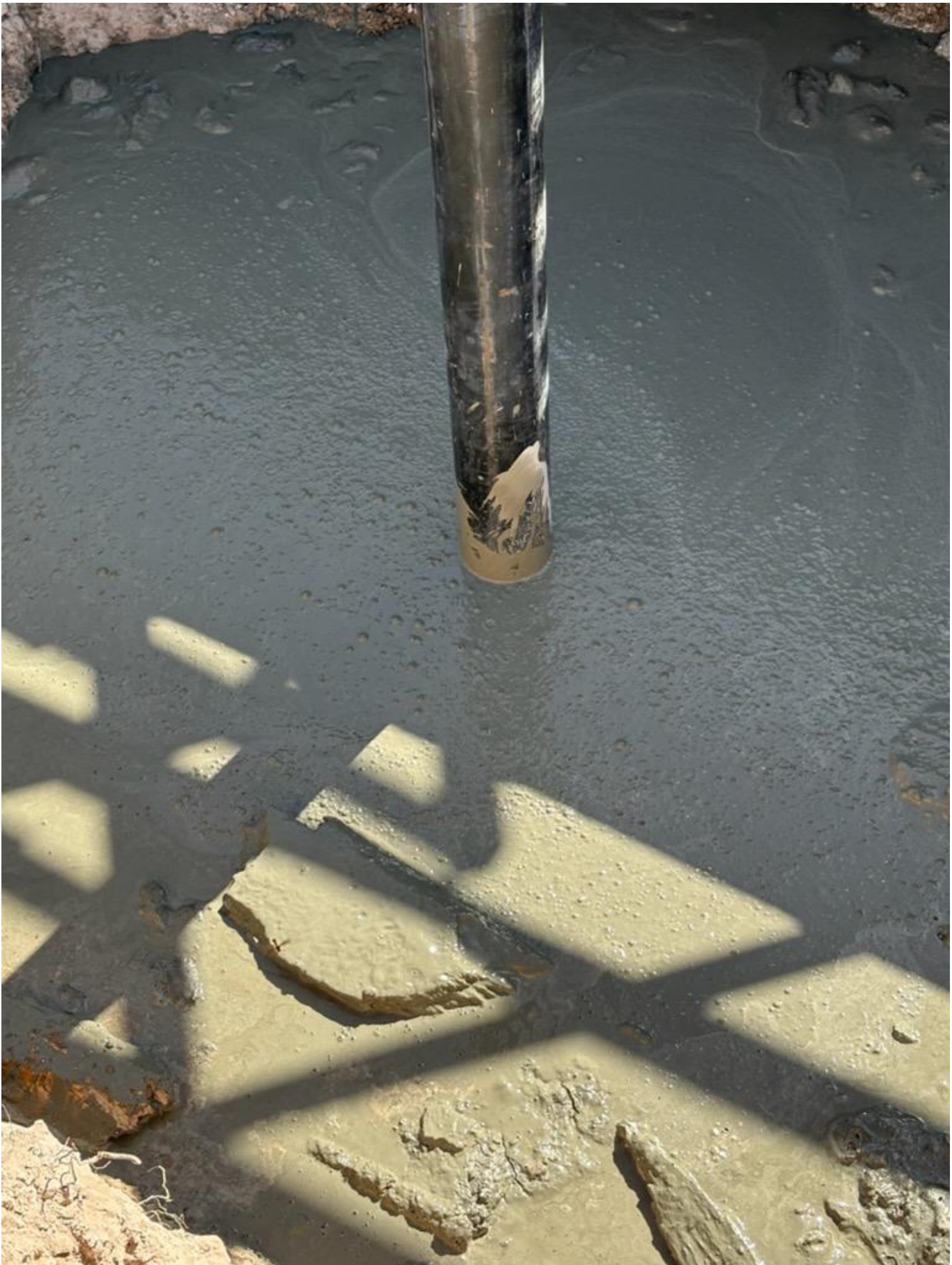
Figure 1: Cellar