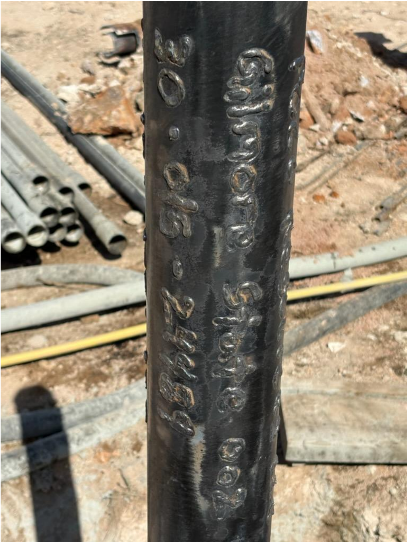
Figure 2: Marker