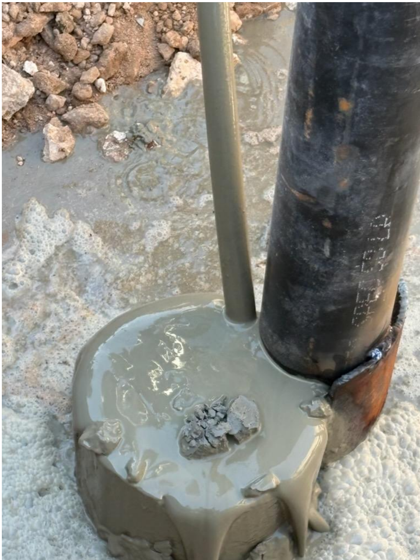
Figure 4: Top Off