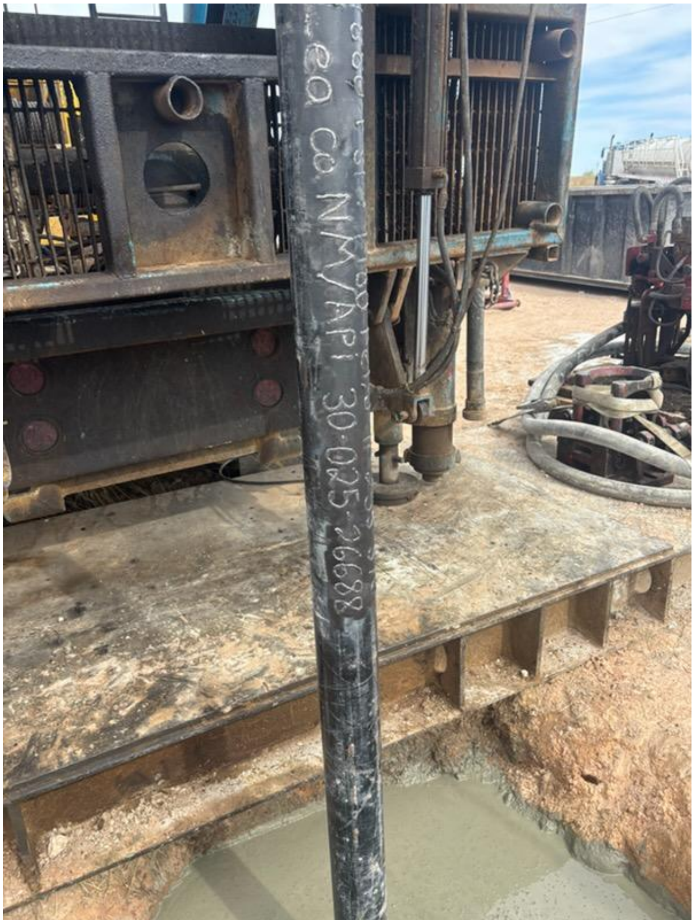
Figure 3: Marker II