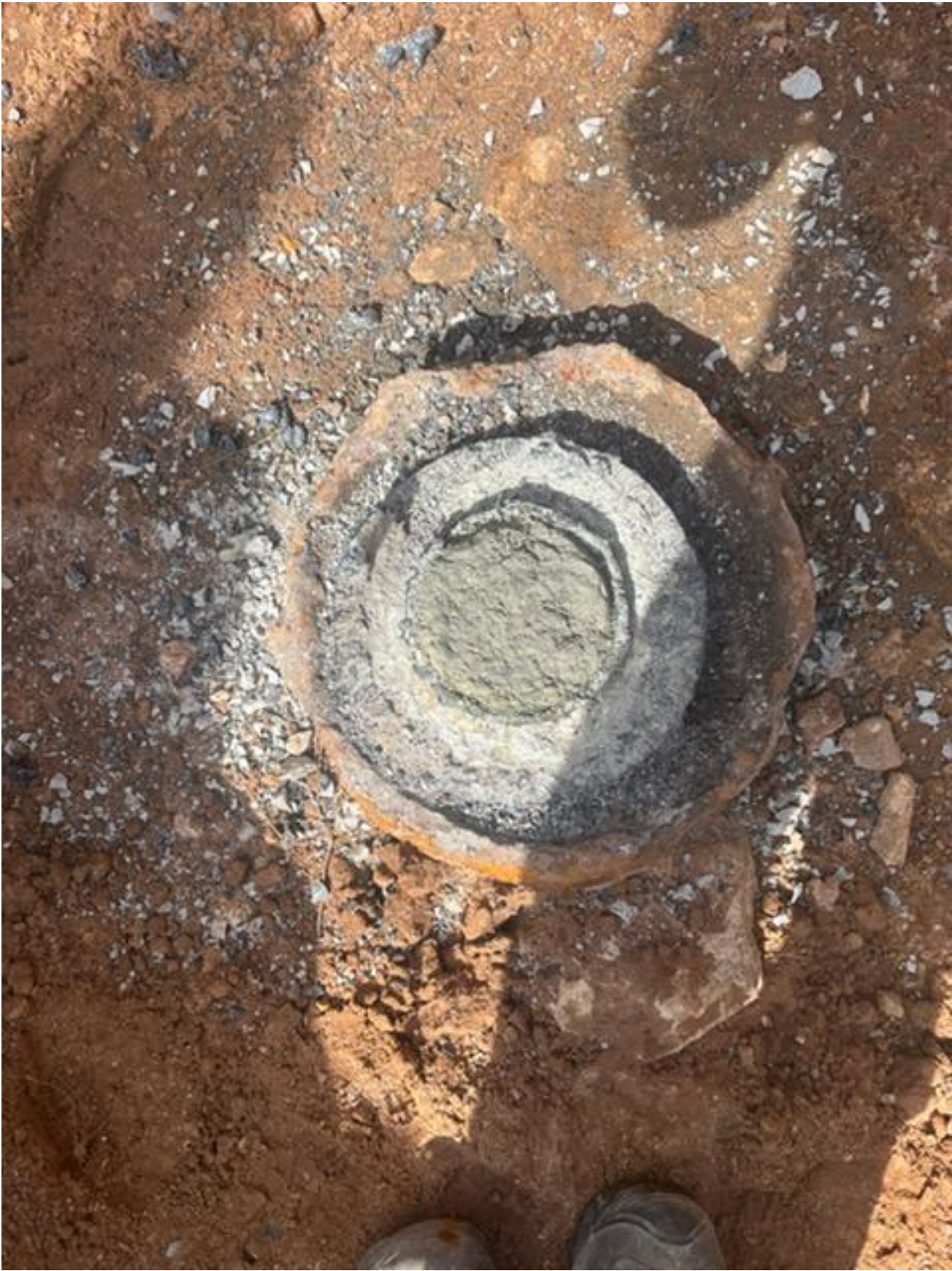
Figure 4: Cut Off