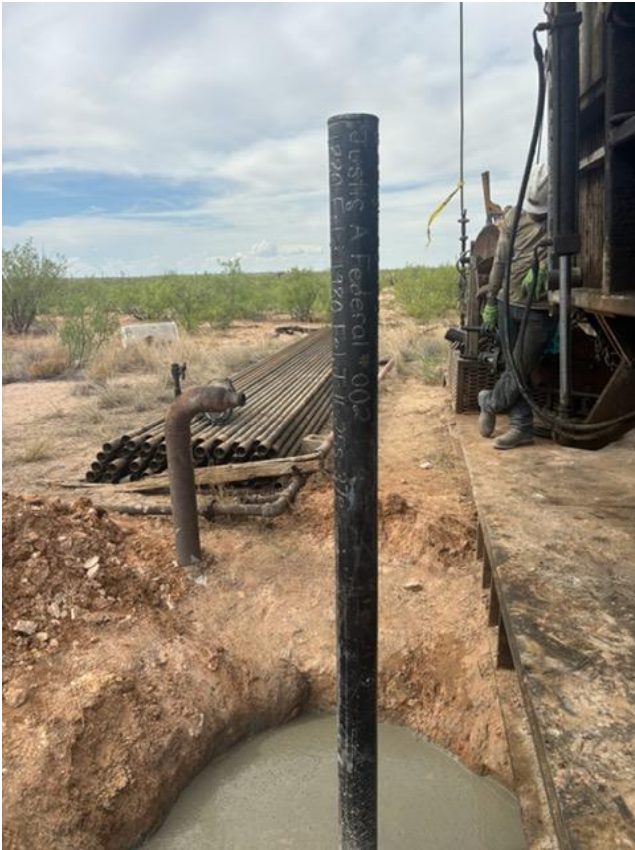
Figure 2: Marker