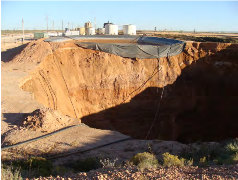
Loco Hills brine well collapse , morning, November 7, 2008, sinkhole with fresh water pond in foreground.