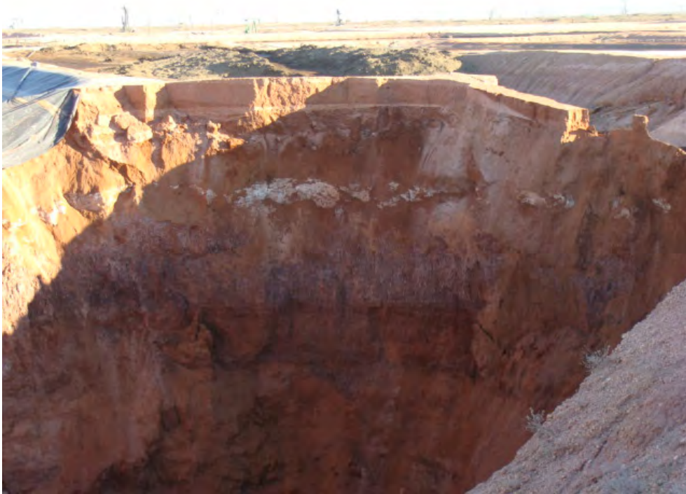
Loco Hills brine well collapse , morning, November 7, 2008 sinkhole.