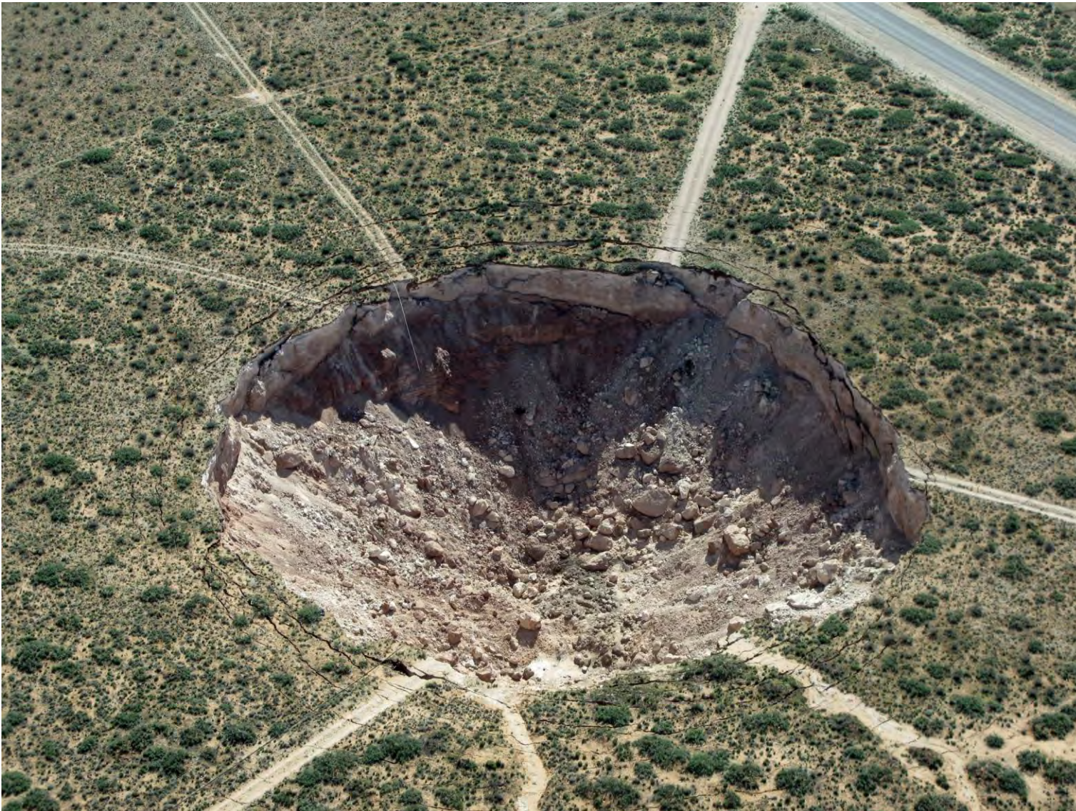
Figure 1: Jim's Water Services brine well (BW-005) on August 26, 2008.