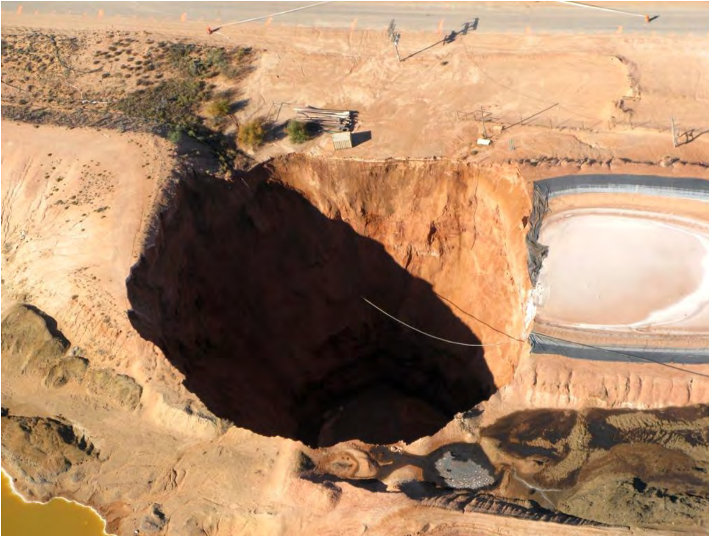
Figure 2: Loco Hill's Water Disposal Company (BW-021) on November 18, 2008.