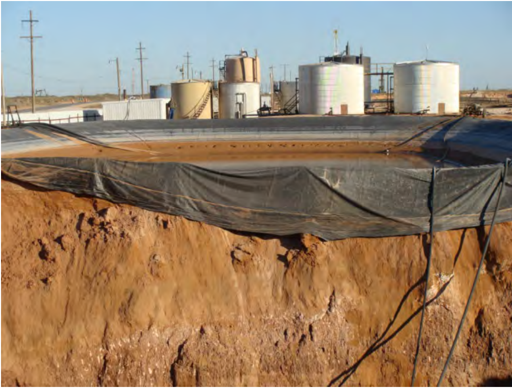
Loco Hills brine well collapse , morning, November 7, 2008 status of fresh water pond.