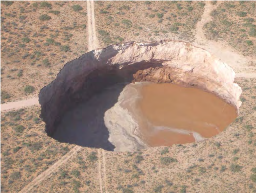
Artesia brine well collapse morning, July 22, 2008