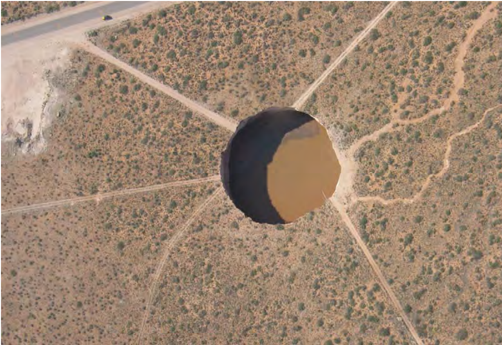
Artesia brine well collapse , morning, July 20, 2008 at 10:44 am.