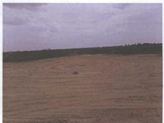
Site seeded and tilled, facing east 8/17/2012