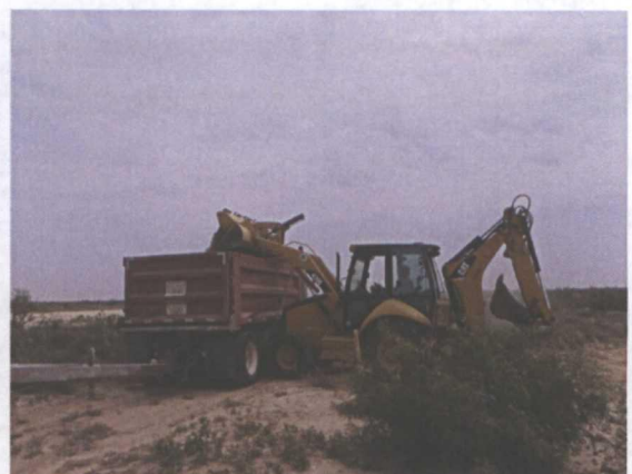
Exporting soil, facing north 7/16/2012