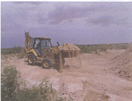
Exporting soil, facing east 7/16/2012