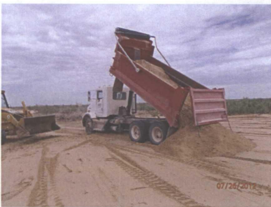
Importing soil, facing north 7/26/2012