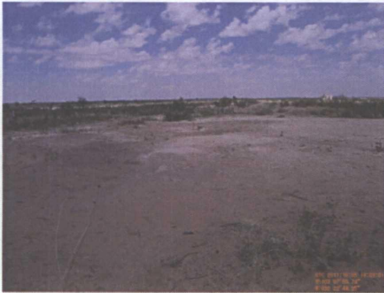
Site prior to scraping, facing north 10/5/2011