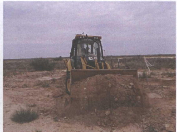
Scraping site, facing south 7/16/2012