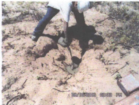
Topping of each hole to counter slumping.