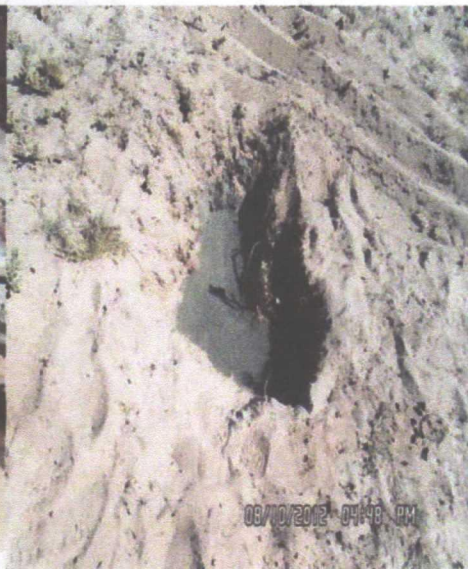
Holes filled with cement grout