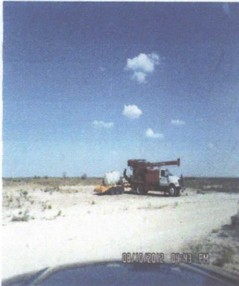
Atkins rig @ water pump traile