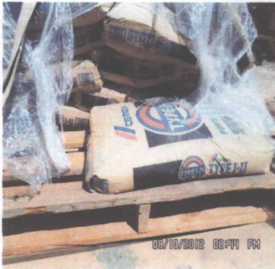
Type I-II Cement Bags