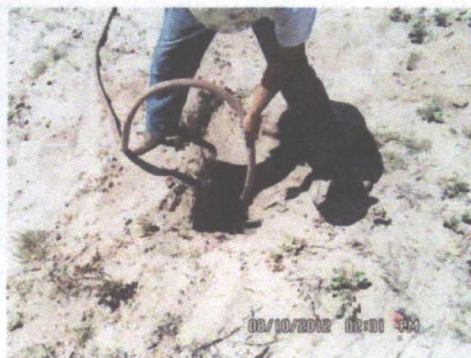
Each MW was filled with Cement Type I-II and 1-3% bentonite grout.