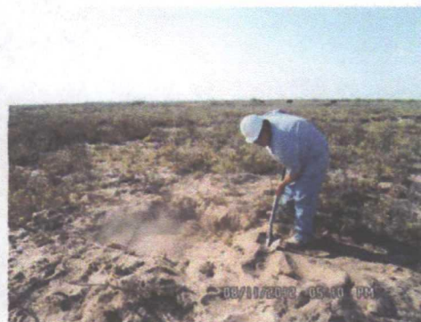
24 hours later-each hole was backfilled with native soil.