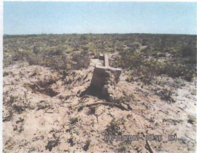
Typical removal process- dug around MW and hand cut pipe and removed with rig.