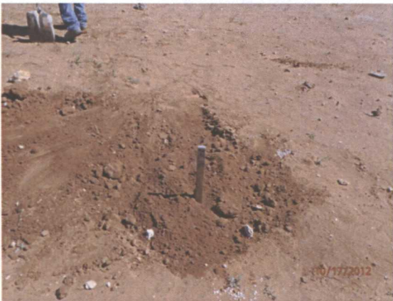
MW-1 plugged and abandoned completed, facing east