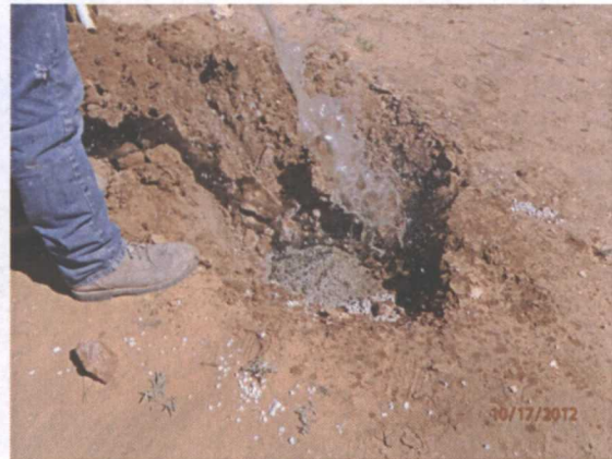
Plugging MW-1 with a 1-3% bentonite/concrete slurry and a 3 ft concrete cap, facing east