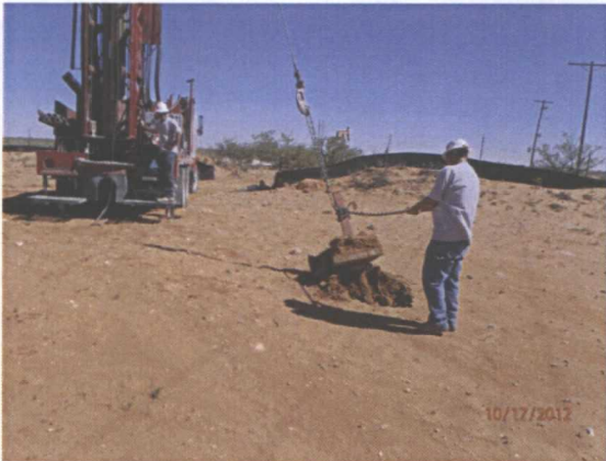
Pulling MW-1, facing east