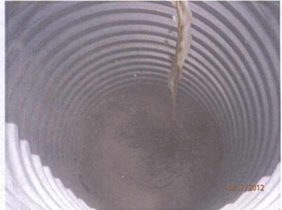
Plugging MW-1 with a 1-3% bentonite/concrete slurry with a 3 ft concrete cap