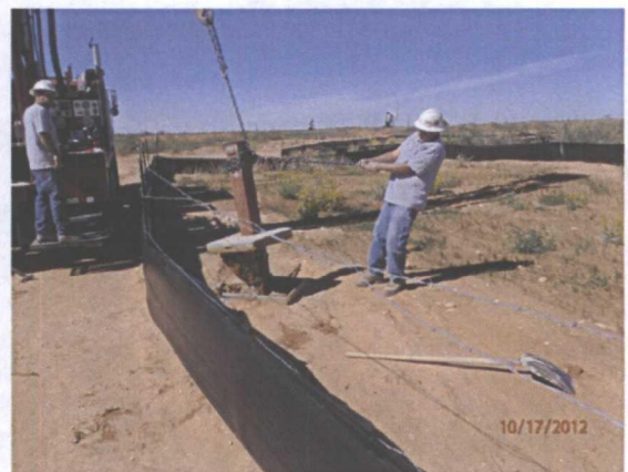
Pulling MW-2, facing west