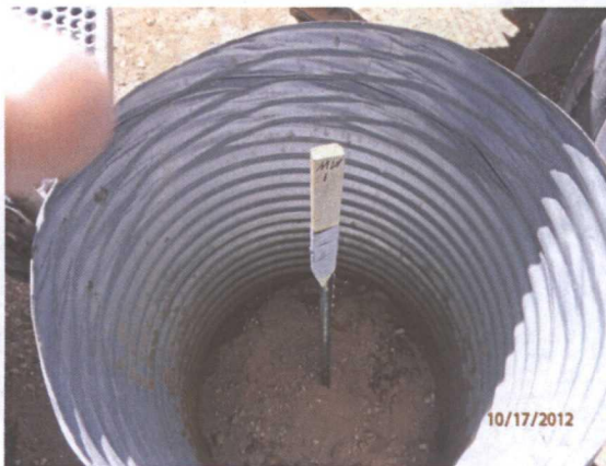
Completed plug and abandonment of MW-1