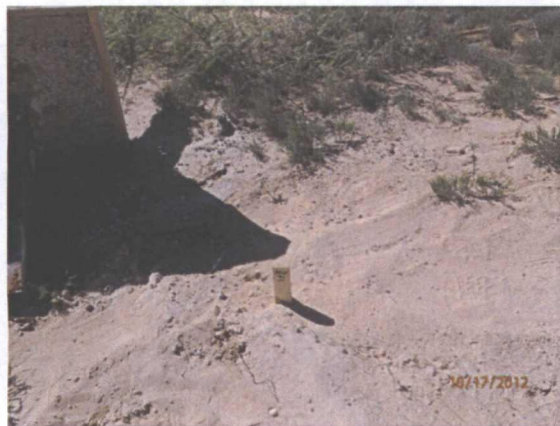
Completed plug and abandonment of MW-3, facing south