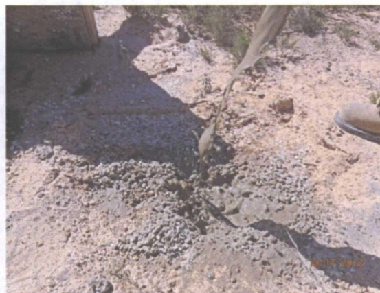
Plugging MW-3 with a 1-3% bentonite/concrete slurry with a 3 ft concrete cap