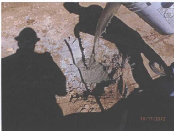
Plugging MW-2 with a 1-3% bentonite/concrete slurry with a 3 ft concrete cap