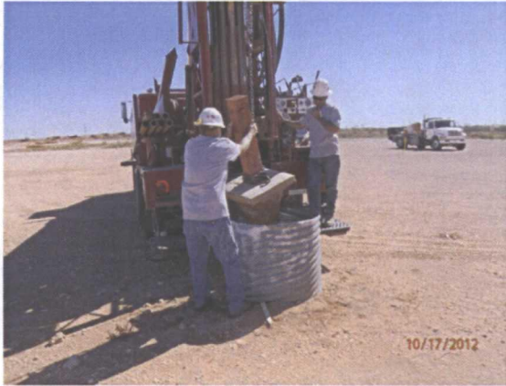
Pulling MW-1, facing east