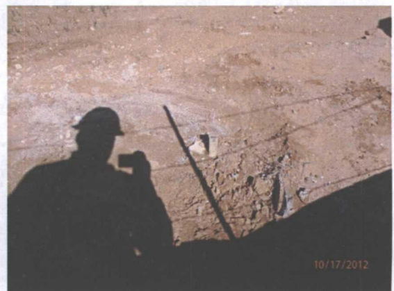
Completed plug and abandonment of MW-2, facing north