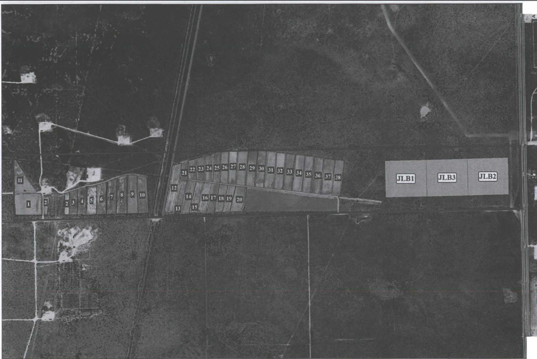
J & L Landfarm - 2014 Background Soil Testing Map

Property Boundary Treatment cell Background Testing Zone