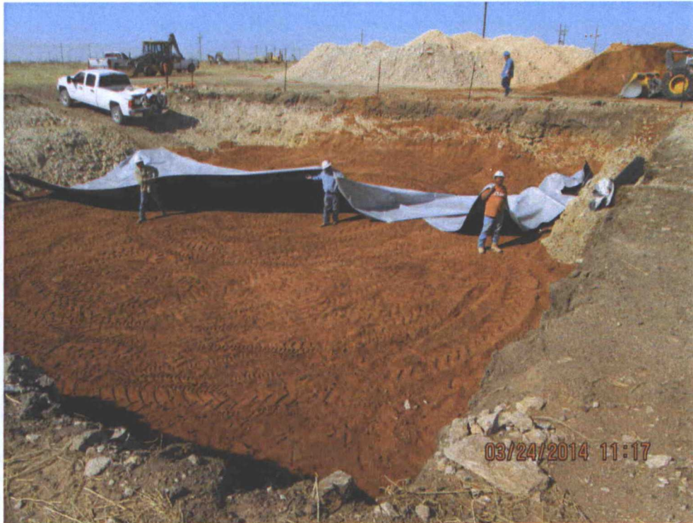
Pit #3 Liner Installation Viewing Southwest, March 24, 2014