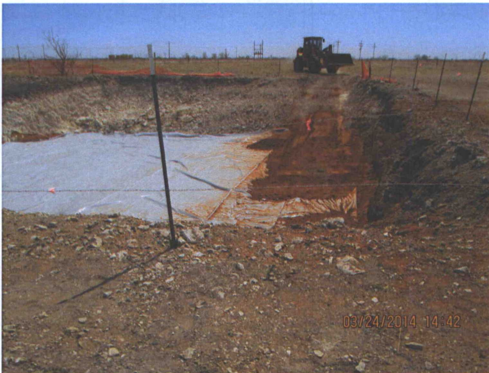
Pit #3 Covering Liner Viewing South, March 24, 2014