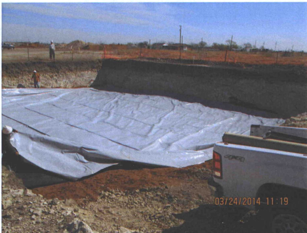
Pit #3 Liner Installation Viewing Northeast, March 24, 2014