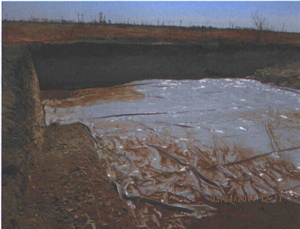
Pit #3 Liner Installation Viewing East, March 24, 2014