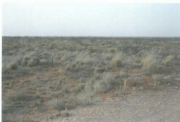
2. Chevron USA Inc. Land Farm, NE/4, Section 3, Township 24 South, Range 36 East - Looking West from Access Road