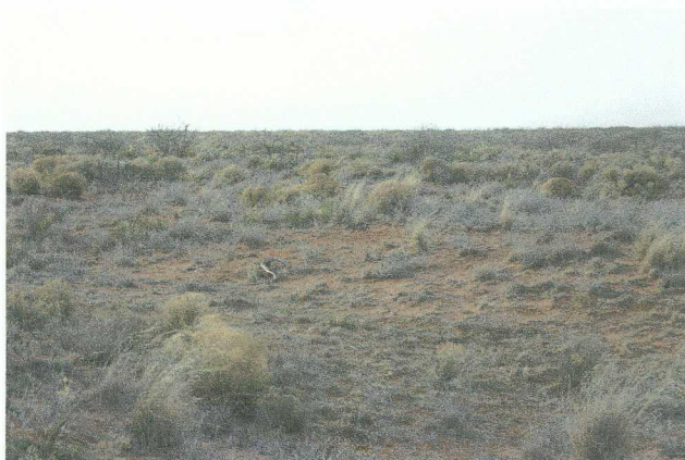
3. Chevron USA Inc. Land Farm, NE/4, Section 3, Township 24 South, Range 36 East - Looking West from Access Road