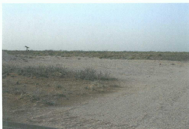
5. Chevron USA Inc. Land Farm, NE/4, Section 3, Township 24 South, Range 36 East - Looking Northwest from Access Road