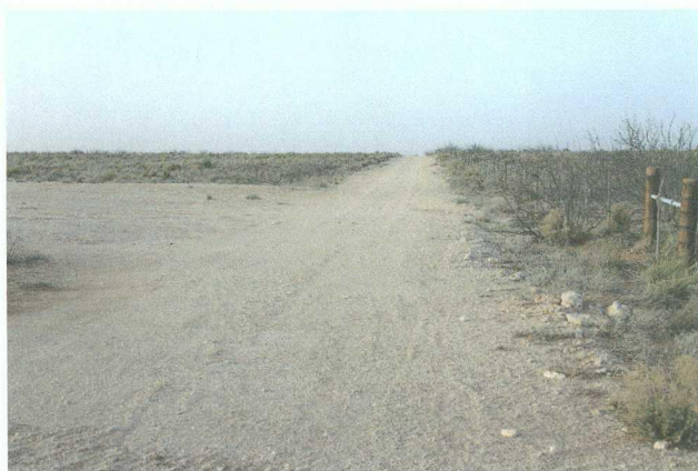
4. Chevron USA Inc. Land Farm, NE/4, Section 3, Township 24 South, Range 36 East - Looking North from Access Road