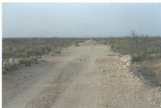
1. Chevron USA Inc. Land Farm, NE/4, Section 3, Township 24 South, Range 36 East - Looking North from Access Road