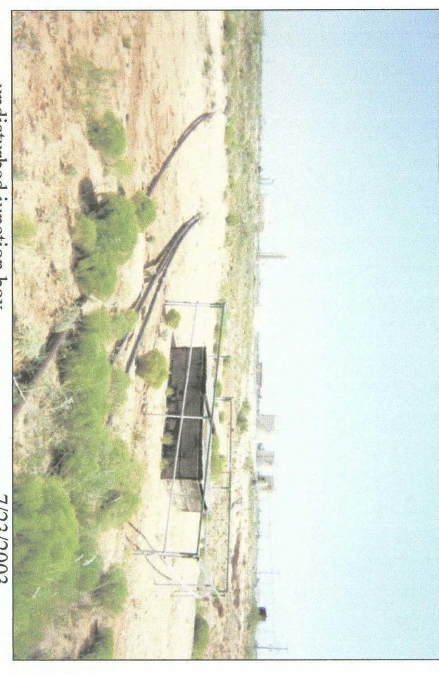
undisturbed junction box