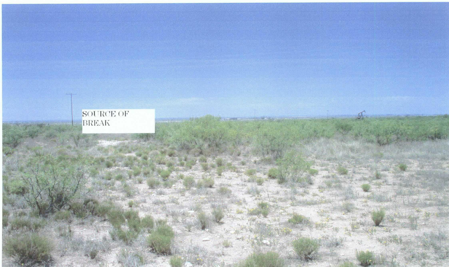
BD I-31 TAKEN 7/17/06