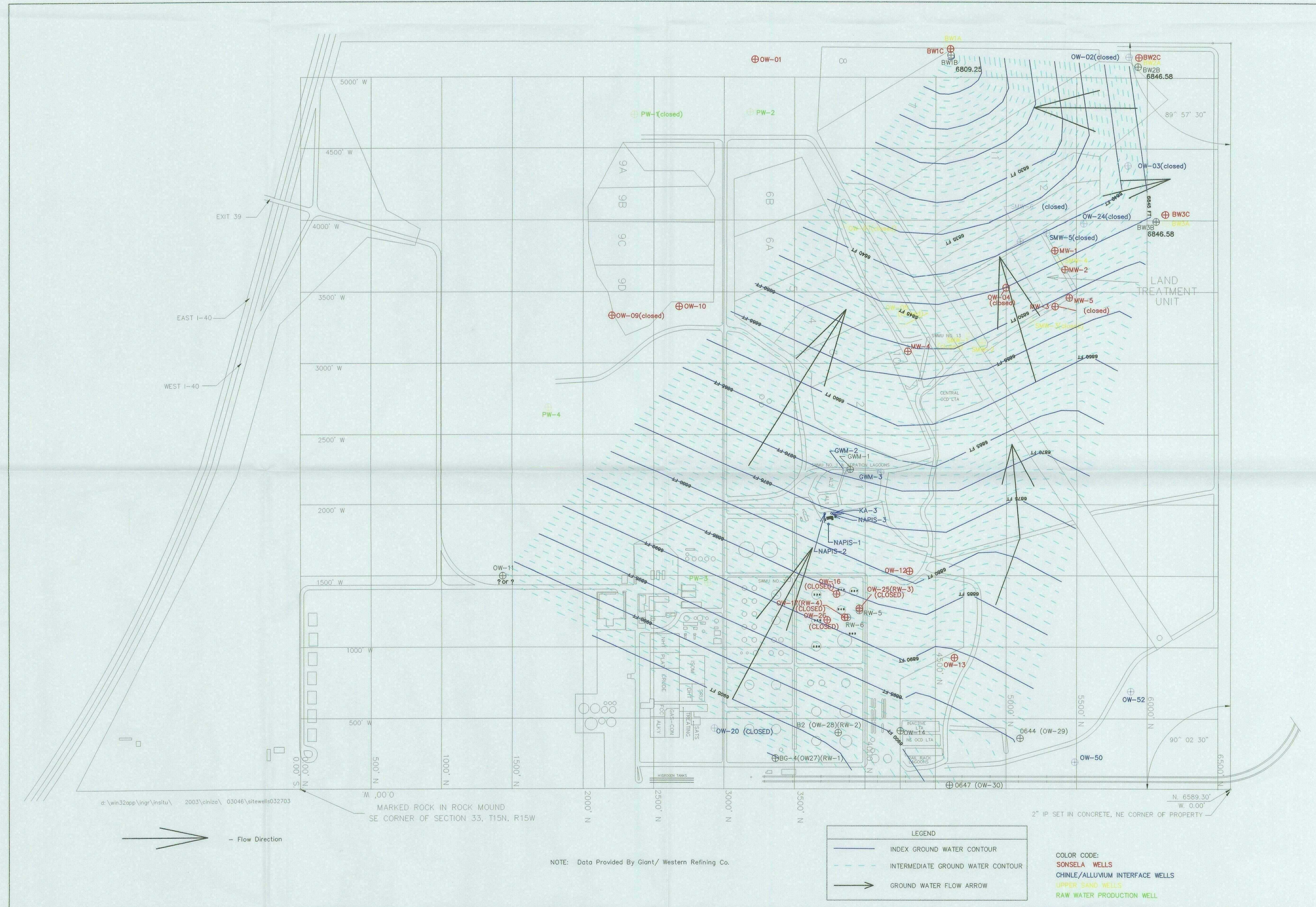
Figure 5 Map of groundwater flow FEBRUARY 2010

Western Refining, Inc. — Ciniza Refinery Interstate 40, Exit 39 Jamestown, New Mexico 87347 Date: FEBRUARY 23, 2010